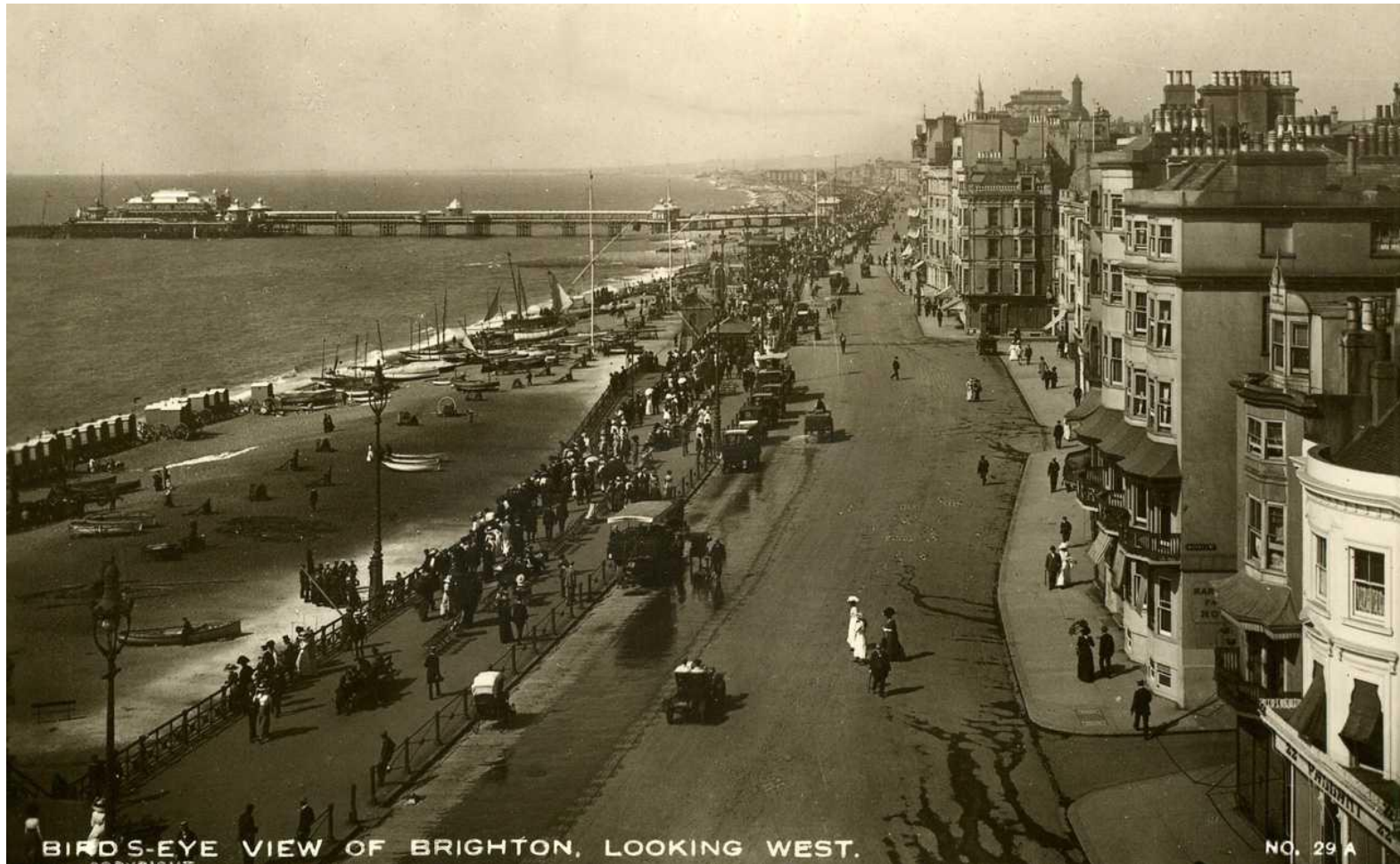
BIRD'S-EYE VIEW OF BRIGHTON, LOOKING WEST.