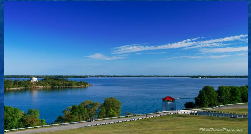
The St. Lawrence river