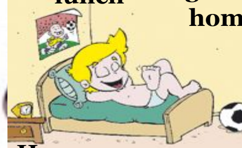
He goes to bed