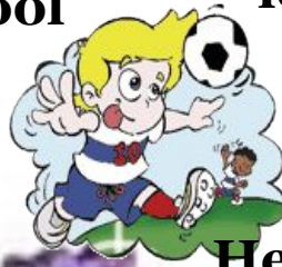
He plays with his friends