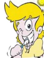
He brushes his teeth