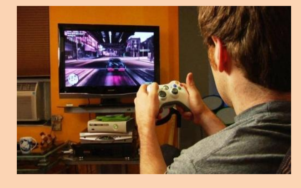
playing computer games