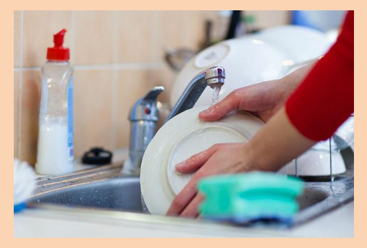
doing the washing up