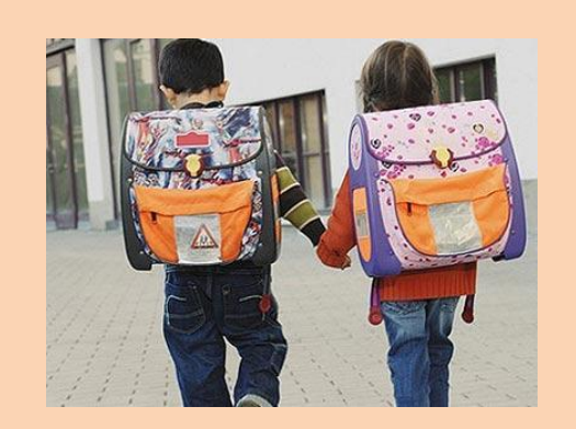
going to school