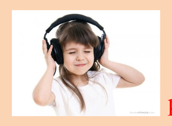
listening to music