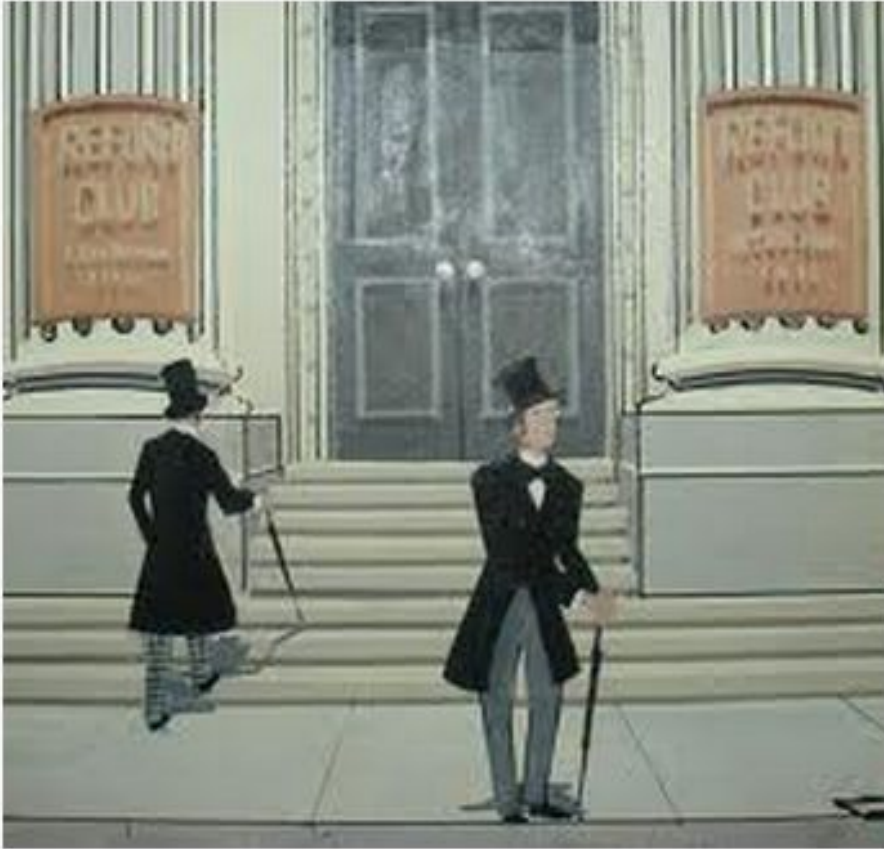
The Reform Club

Phileas Fogg , an eccentric English gentleman and bachelor, lives in London. He is one of the most upstanding members of the Reform Club .