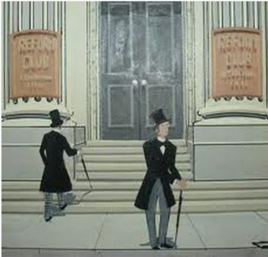
The Reform Club

Phileas Fogg , an eccentric English gentleman and bachelor, lives in London. He is one of the most upstanding members of the Reform Club .