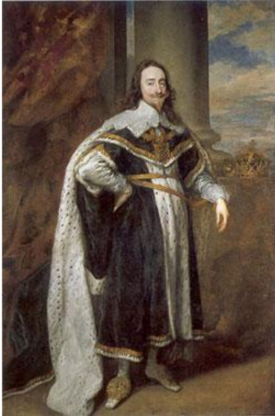
King Charles I

Over thirty Native American tribes living in the South Carolina region made European settlement difficult here. Beginning in 1670, British colonists managed to establish Charles Town (Charleston). Following the Revolutionary War, South Carolina joined the Union as the eighth state on May 23, 1788. Almost a century later, the state left the Union and the Civil War began at Fort Sumter. Racial discrimination continued in South Carolina for many years after the Civil War.