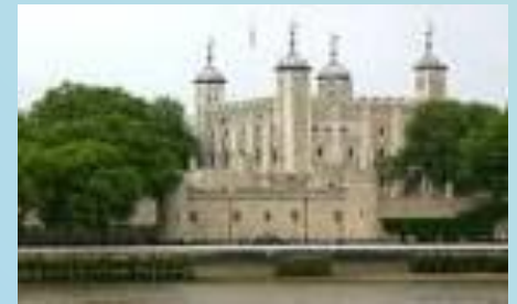
The Tower of London