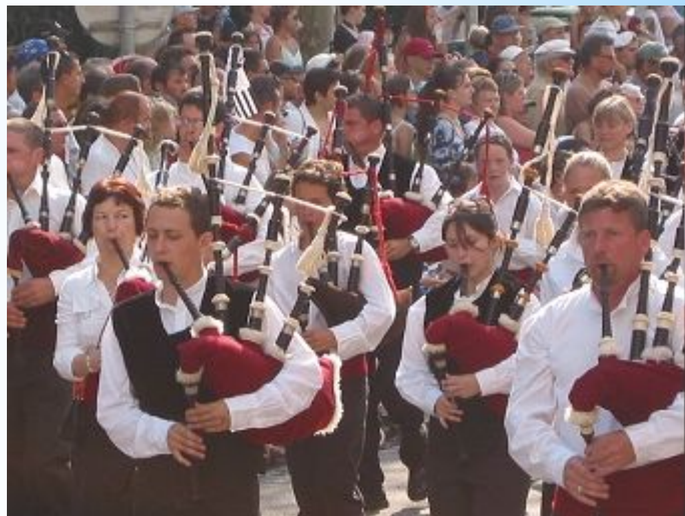
A piper playing the Great Highland Bagpipe.

Scotland has a long and glorious history, rich in customs and traditions which are thoroughly kept and followed.