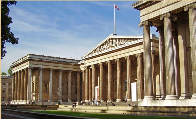
The British Museum