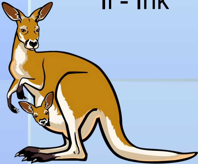
Kk - Kangaroo