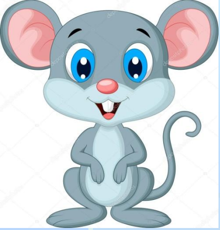
Mm - Mouse