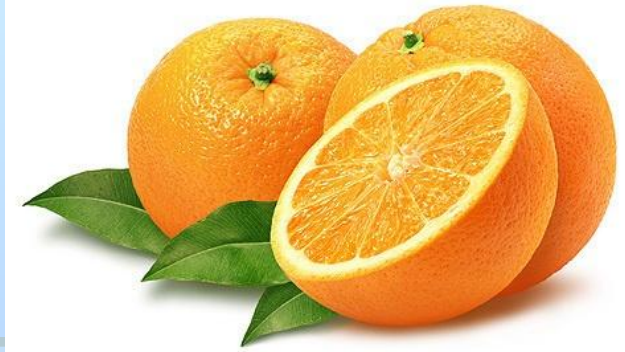
Oo - Orange