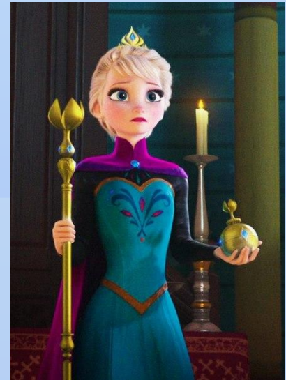
Qq - Queen