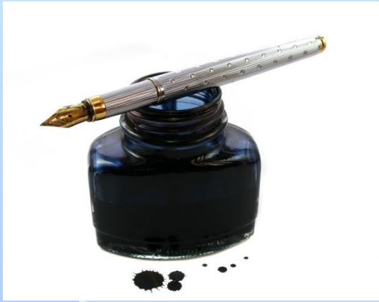
li - Ink