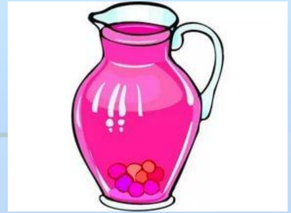
Jj - Jug