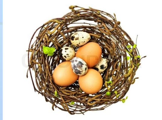
Nn - Nest