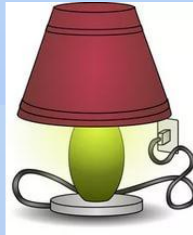
Ll - Lamp