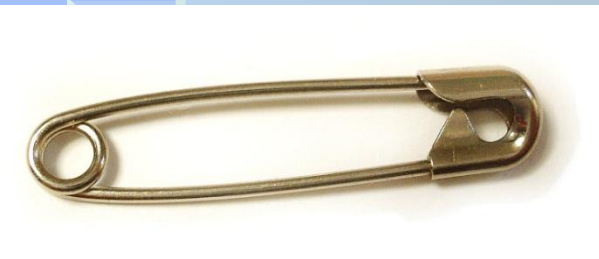
Pp - Pin