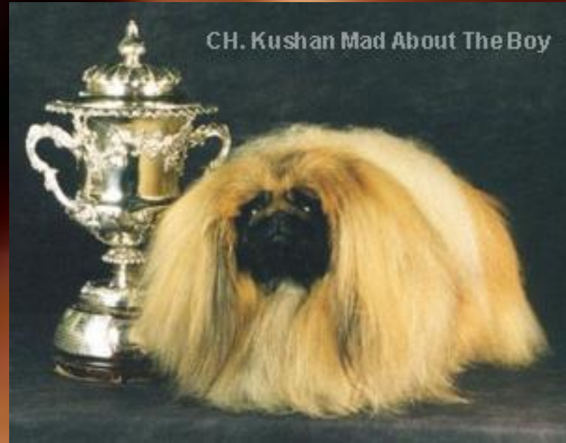
CH. Kushan Mad About The Boy