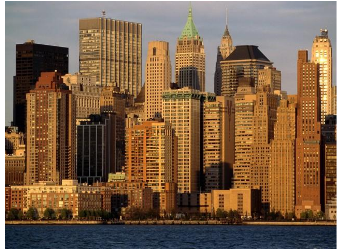
Manhattan New York City, USA