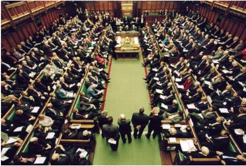
Elected members of Parliament