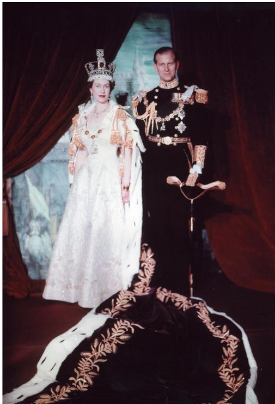
Coronation portrait of Queen Elizabeth II and the Duke of Edinburgh, June 1953