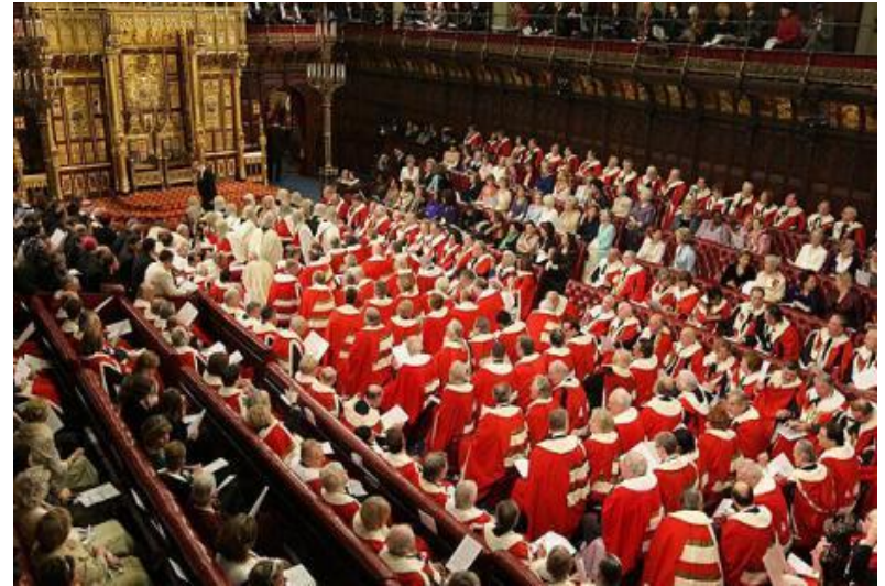
Non-elected members peers and life peers