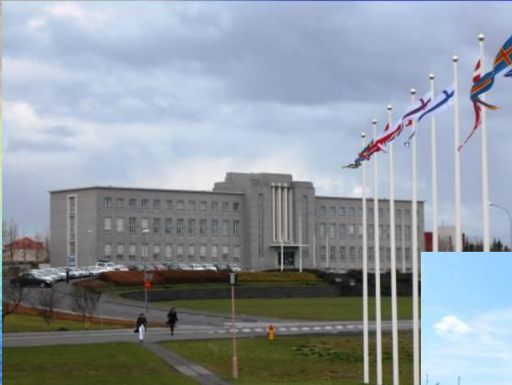
University of Iceland (1911) (public)