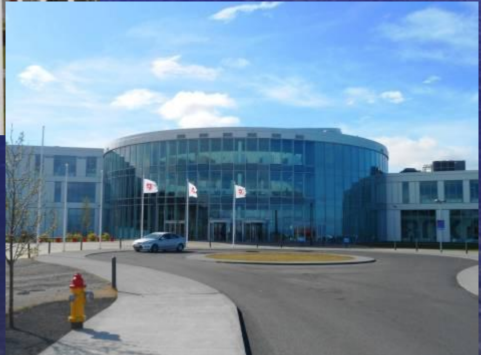
Reykjavik University (1998) (private)