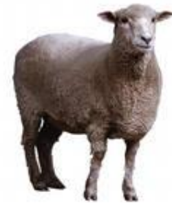
A sheep says