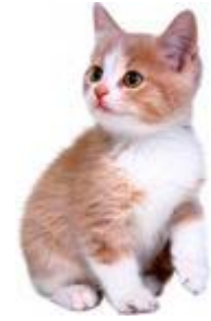
A cat says