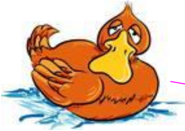
A duck says