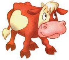
A cow says