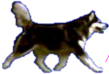
A dog says