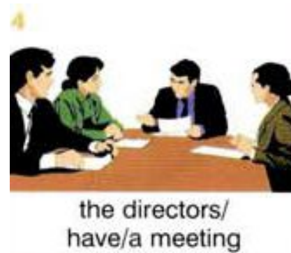
the directors/ have/a meeting