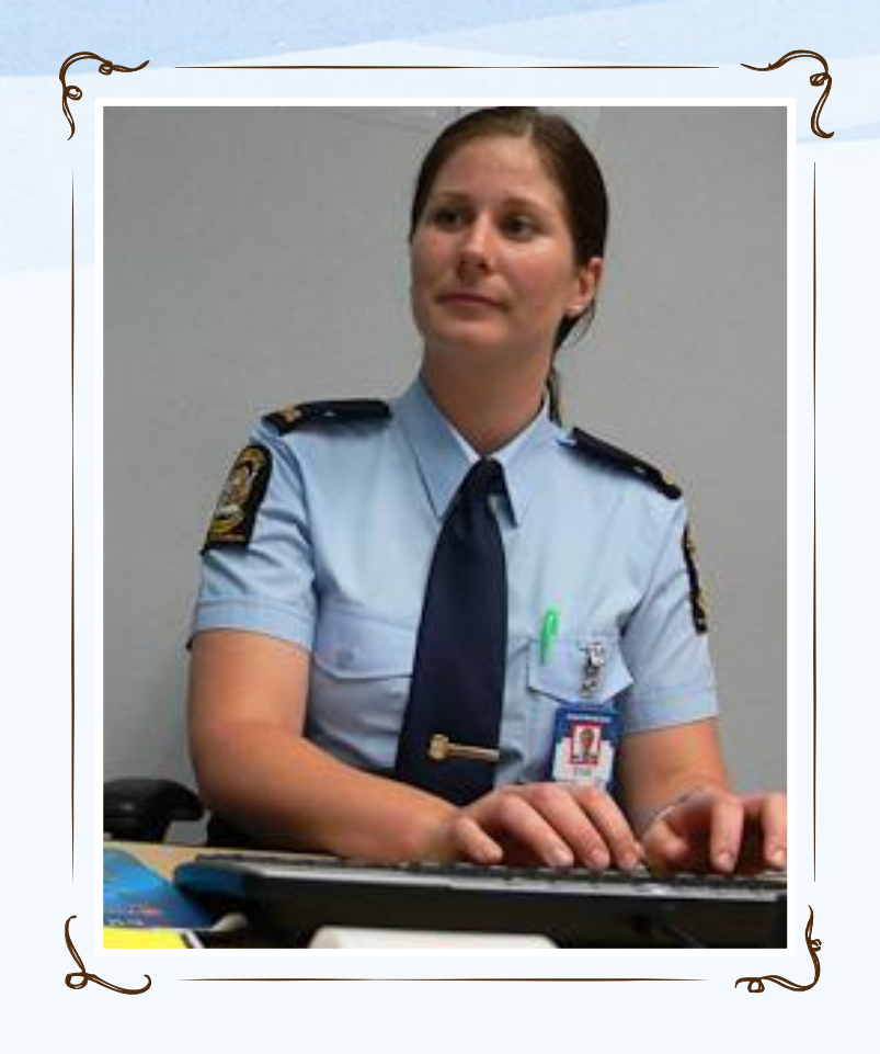
work as a customs officer