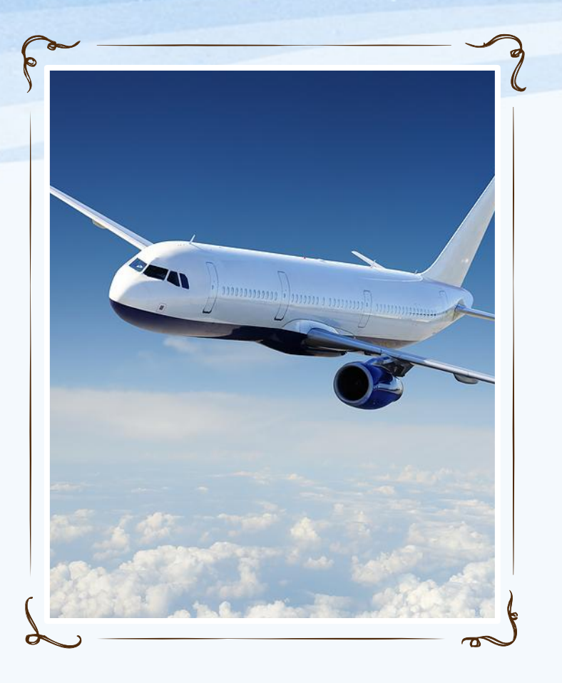
travel by plane