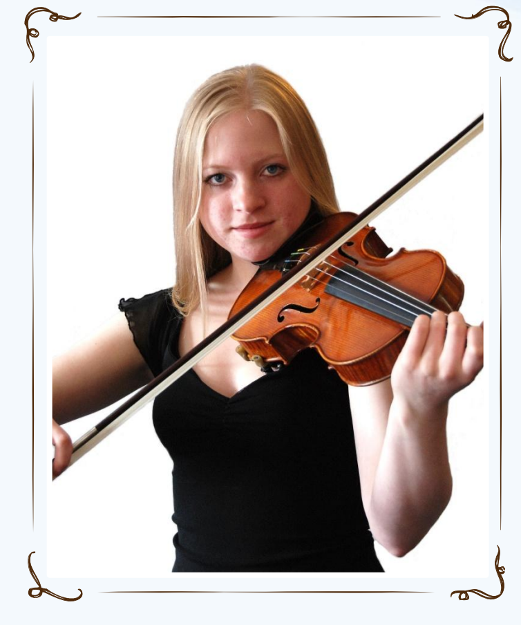
play the violin