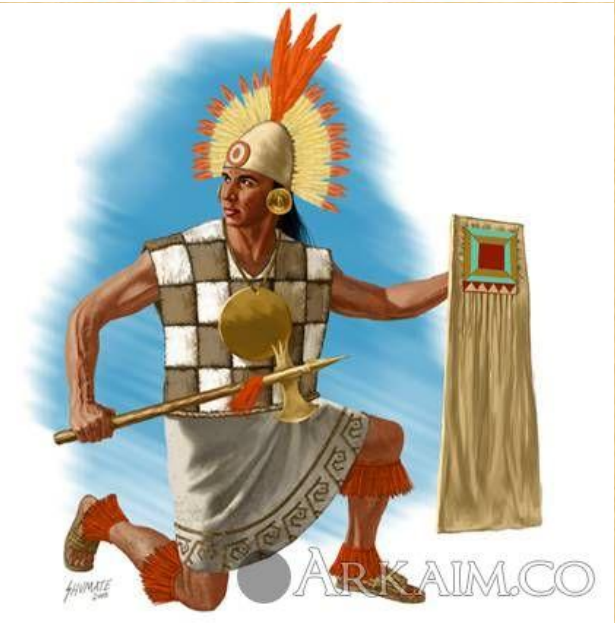
Clothing of the Incas.