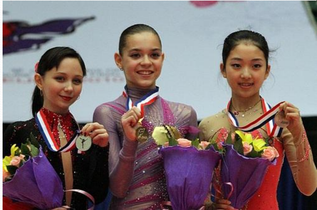
Sotnikova with medalists Elizaveta Tuktamysheva and Li Zijun at the 2010–11 JGP Final

● Adelina Sotnikova began skating at the age of four at the Yuzhny ice rink near her home in Moscow. At the age of seven she began training at CSKA which is further away from her home. She began working with coach Elena Buianova (Vodorezova) a year later.