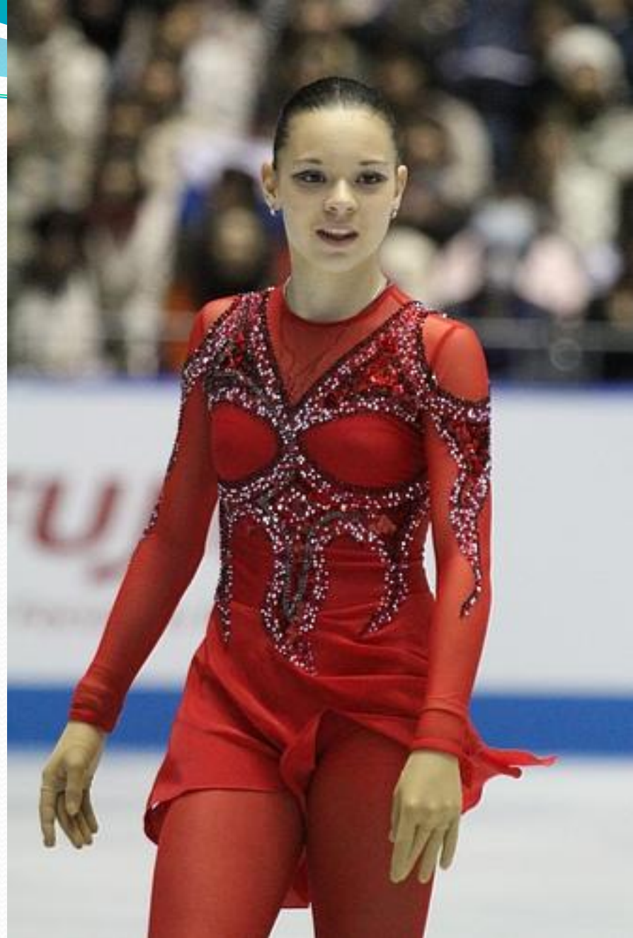
Sotnikova at the 2012 ISU World Team Trophy

● Adelina Dmitriyevna Sotnikova (born 1 July 1996) is a Russian figure skater. She is the 2014 Olympic champion, a two-time European silver medalist (2013–2014), a five-time medalist on the Grand Prix series, and a four-time Russian national champion (2009, 2011–2012, 2014). On the junior level, she is the 2011 World Junior champion and 2012 Youth Olympics silver medalist. She is the first Russian to win the Olympic gold medal in ladies' singles figure skating.