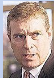
Andrew Duke of York