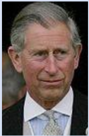
Charles Prince of Wales