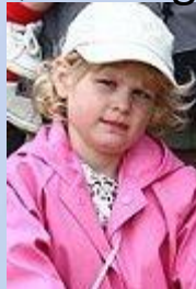
Lady Louise Windsor