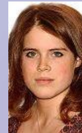
Princess Eugenie of York