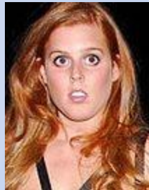
Princess Beatrice of York