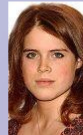
Princess Eugenie of York