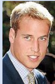
Prince William of Wales