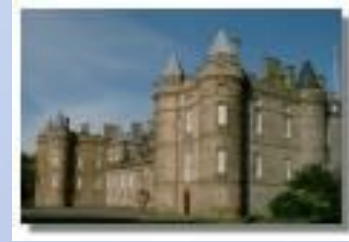
THE PALACE OF HOLYROODHOUSE