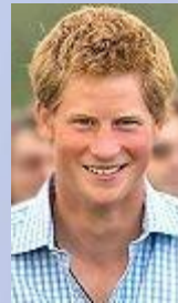
Prince Harry of Wales