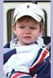
James Viscount Severn