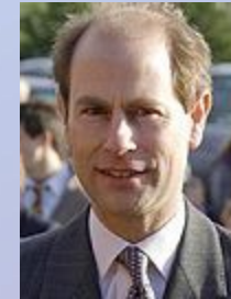
Edward Earl of Wessex