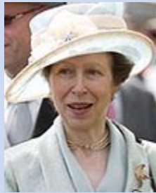
Anne Princess Royal