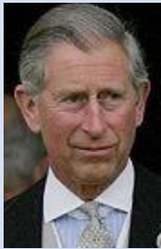
Charles Prince of Wales