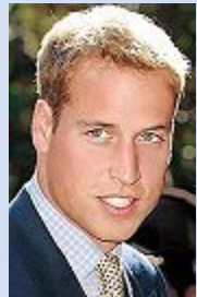
Prince William of Wales