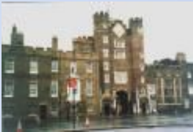
ST. JAMES PALACE