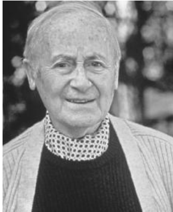
● Joan Miro