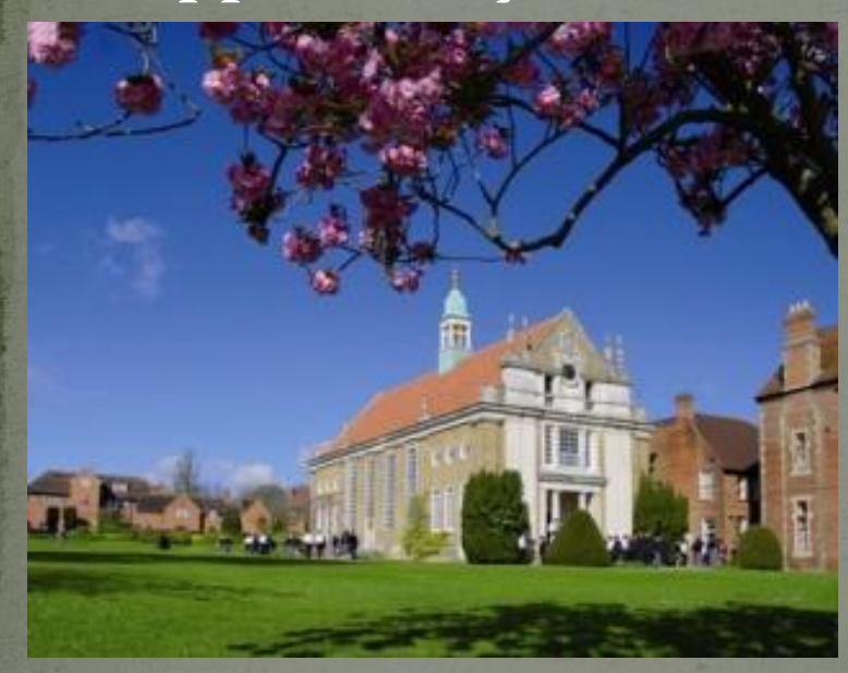
Founded in 1868 Age: 4 – 18 years The number of students: 1130 people