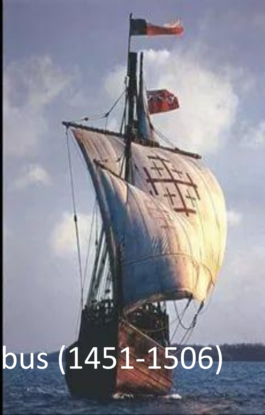
Christopher Columbus (1451-1506)