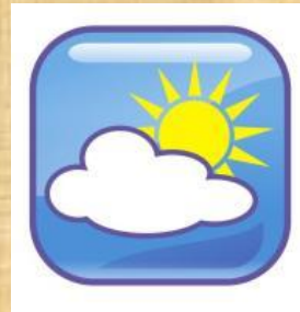
Sunny and cloudy