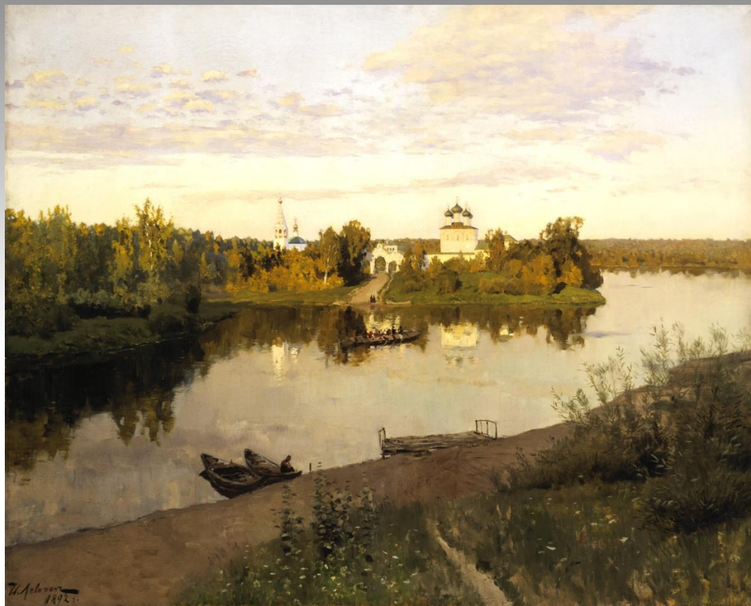
“Evening Bells”, 1892