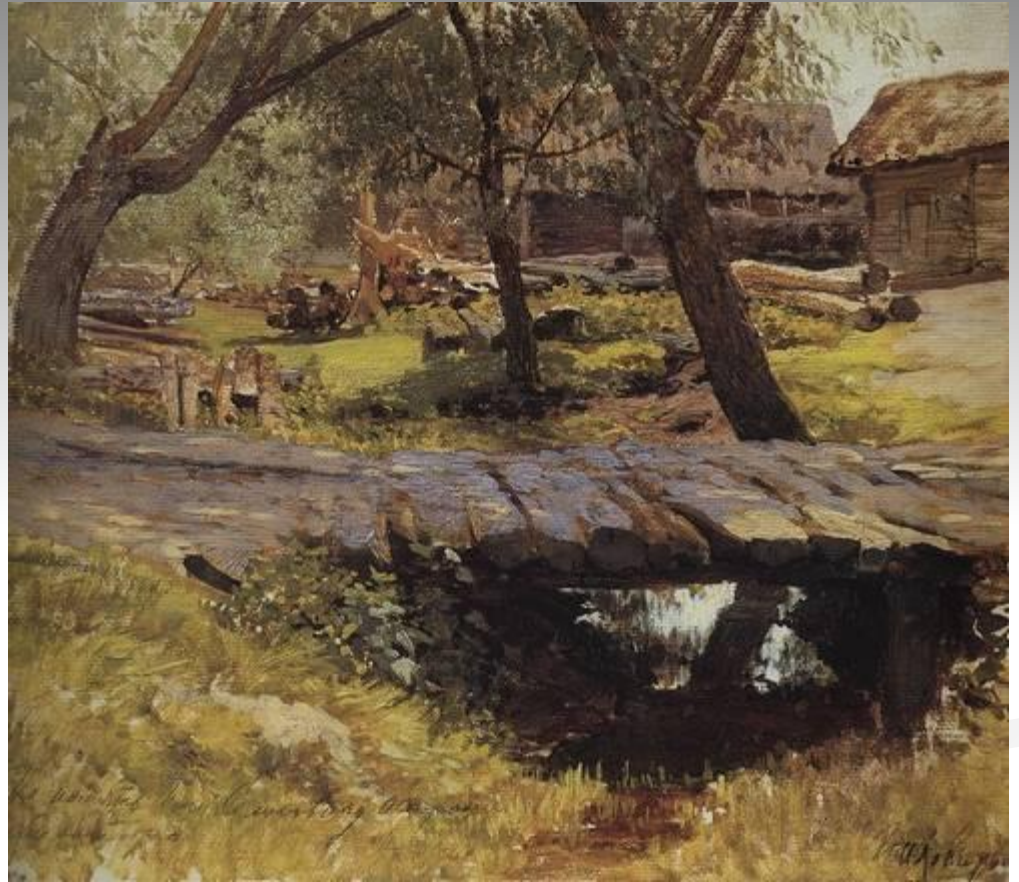
“Bridge. Savvinskaya Sloboda”, 1884