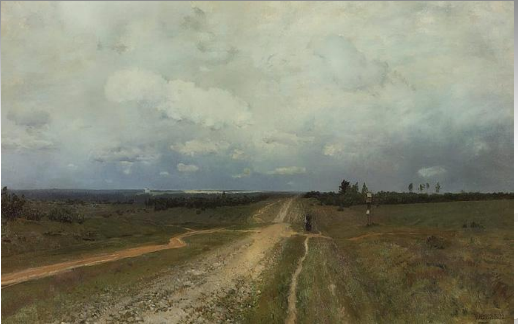
“The Vladimirka”, 1892