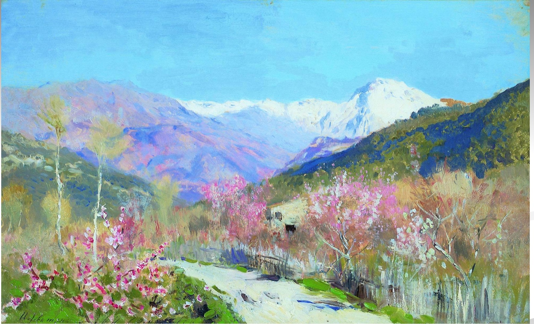
“Spring in Italy”