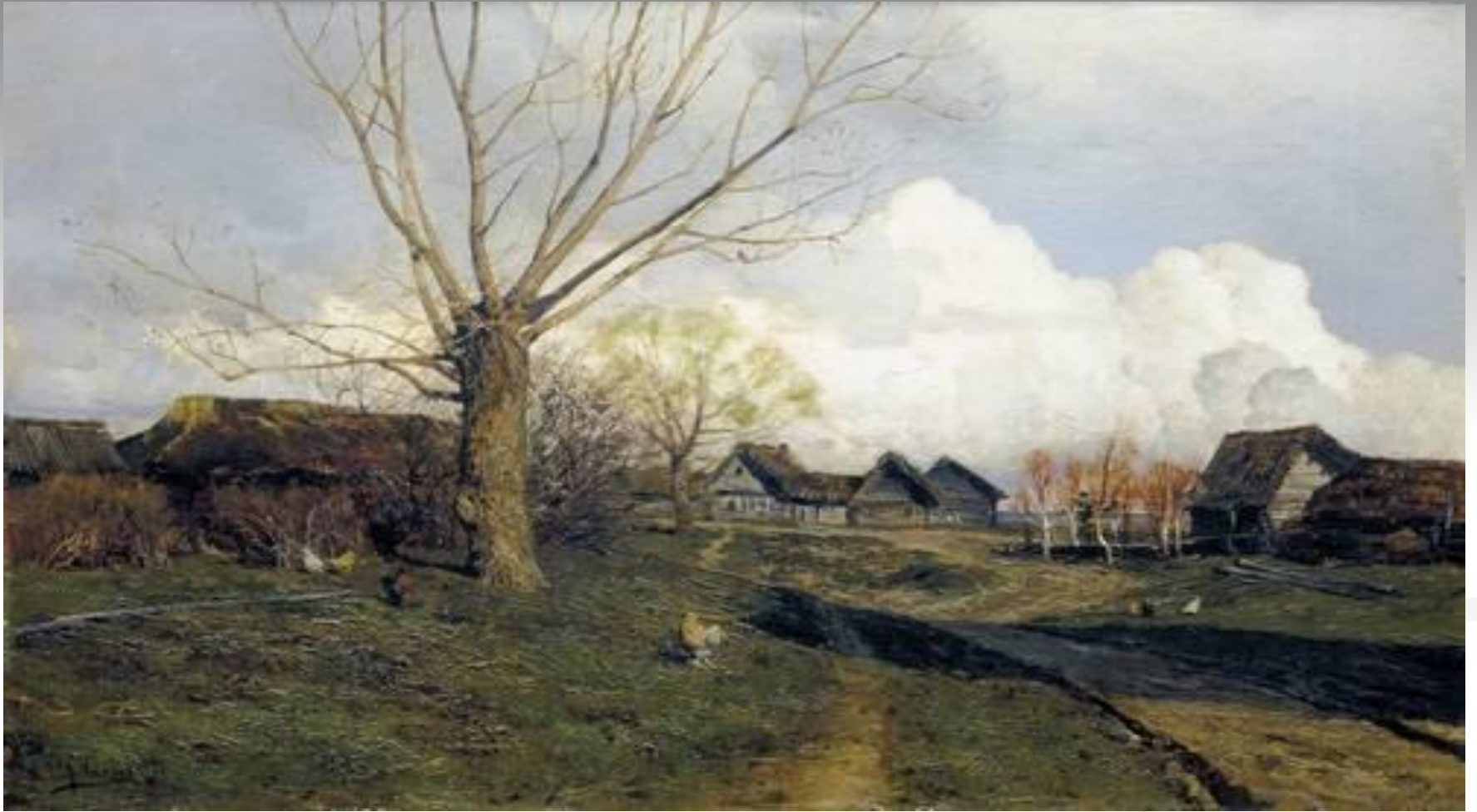
Savvinskaya Sloboda near Zvenigorod, 1884