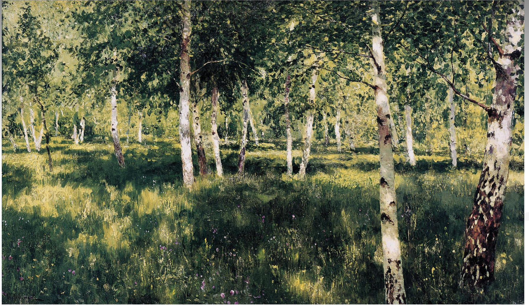
“Birch Grove”, 1885 - 1889