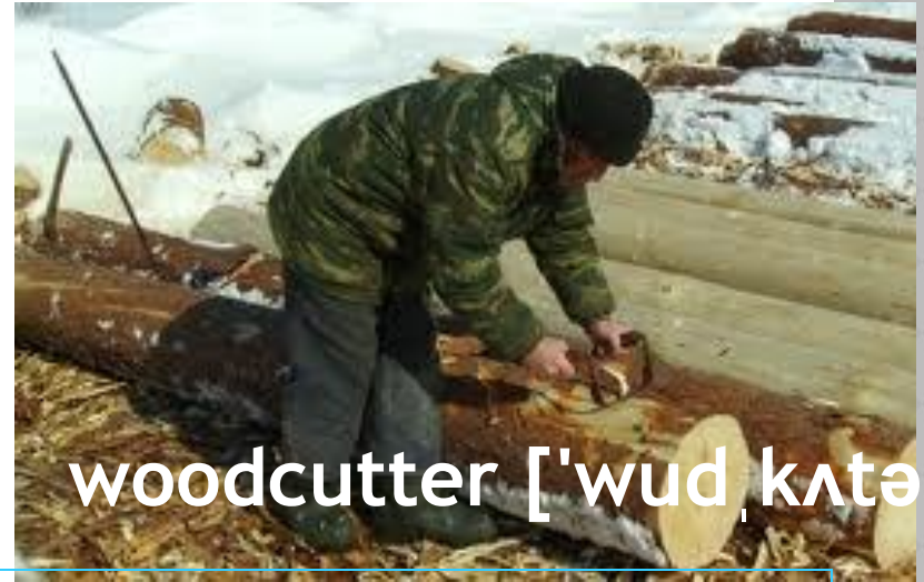
woodcutter ['wud, kʌtə]

backbreaking ['bæk, breɪkɪŋ] - изнурительный, непосильный