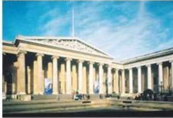
The British Museum