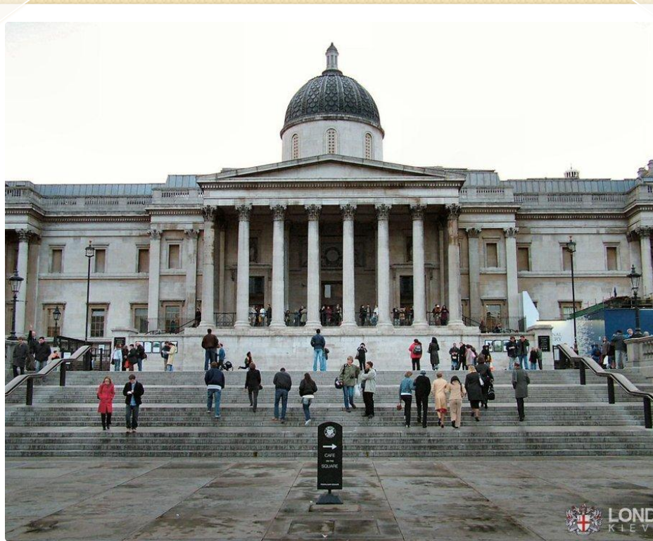
The National Gallery

The National Gallery is one of the best picture galleries in the world.