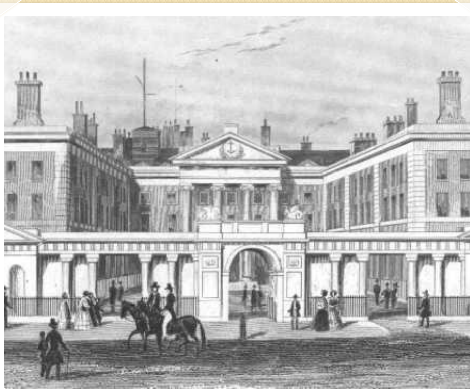
London in 1830

After the Great Fire people built a new city. It became larger and larger. By 1830, there were more than one and a half million people in London. The railways came and London became richer and richer.