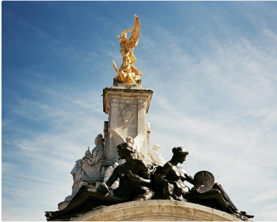
Queen Victoria Memorial

In front of Buckingham Palace is the Queen Victoria Memorial.