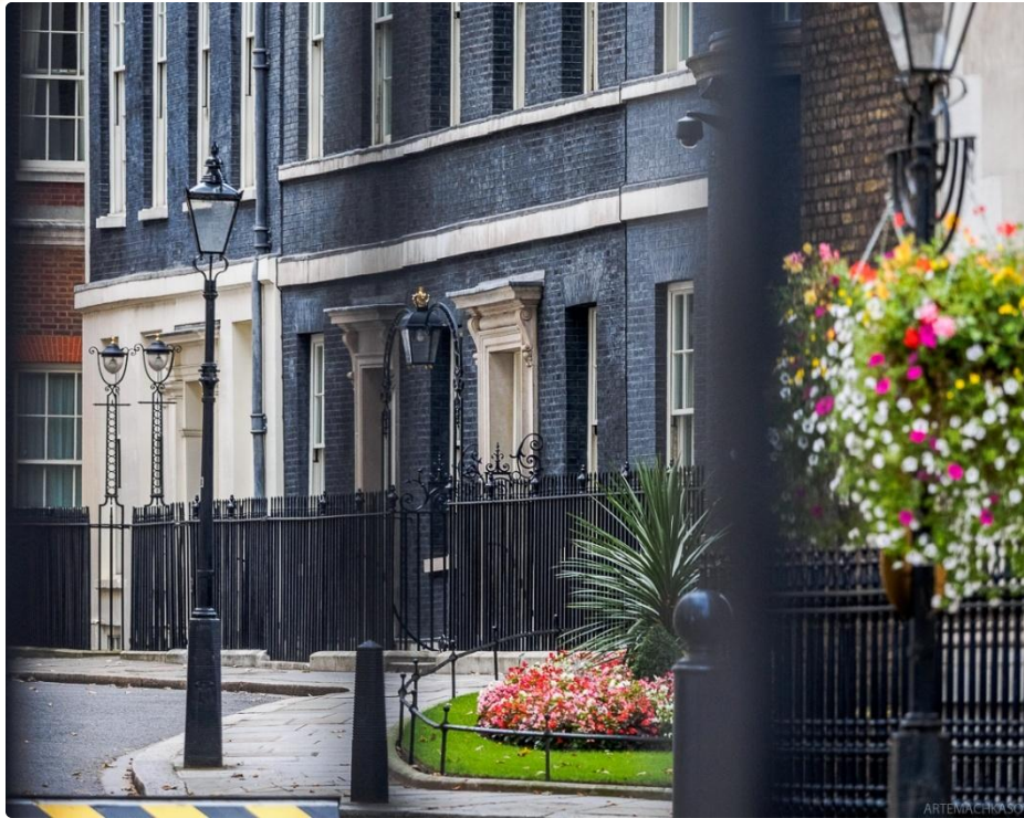
10 Downing Street

The British Prime Minister lives at number 10 Downing Street.