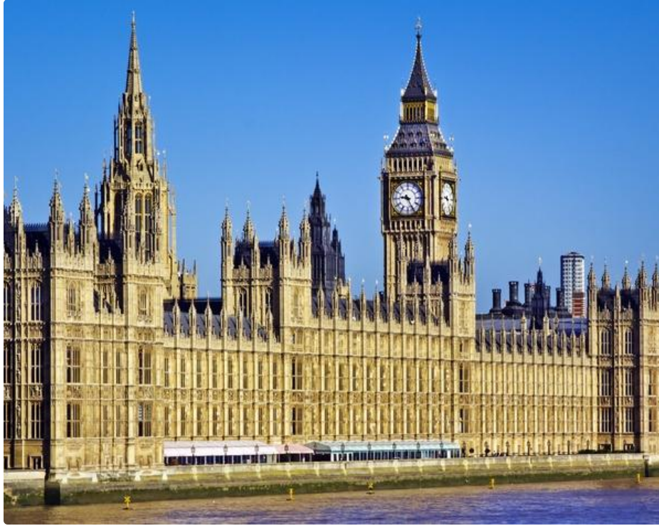
The Houses of Parliament

Parliament square is very large. On the left you can see a long grey building with towers which is the Houses of Parliament.