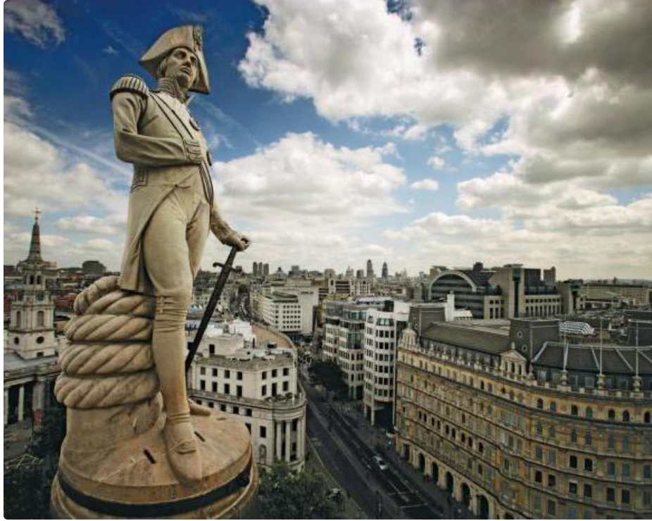
Admiral Nelson Column

In the middle of it stands a tall column. It is a monument to Admiral Nelson.