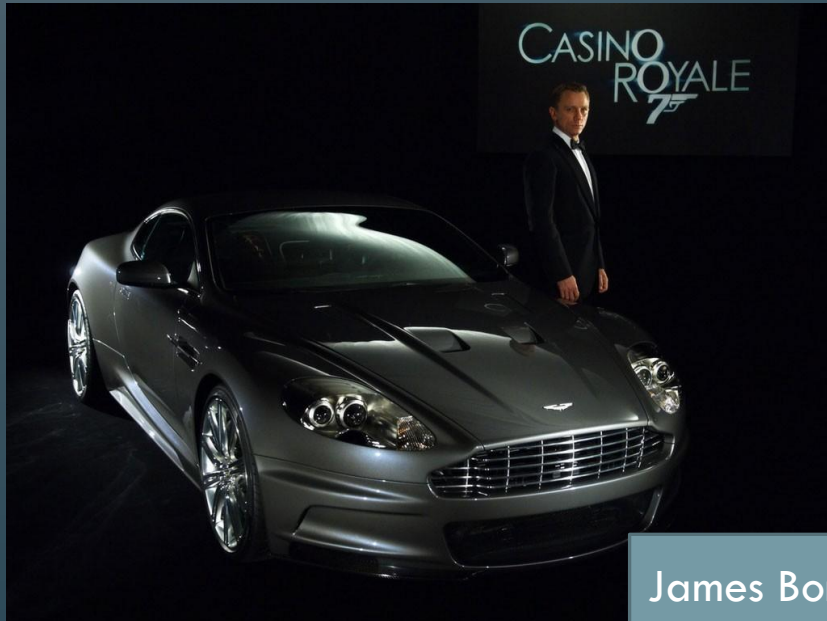
James Bond and his favourite car