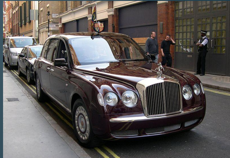
Queen Elizabeth II's Bentley State Limousine