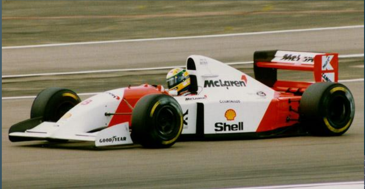
Bruce Leslie McLaren 1937-1970 The founder of the most successful McLaren team