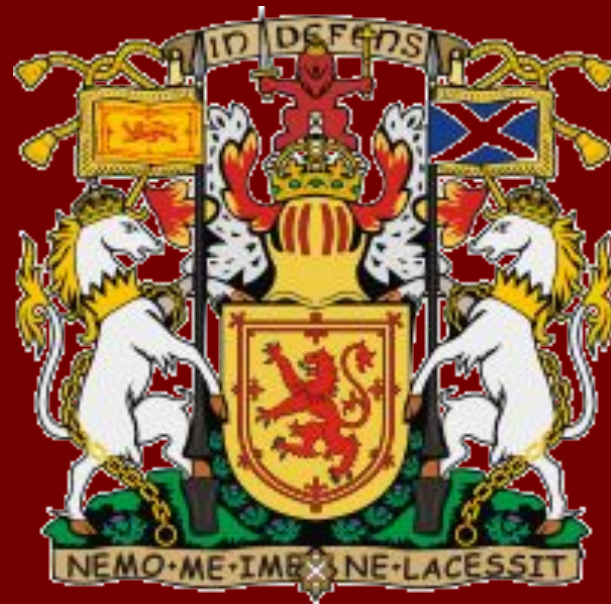
Scotland, big coat of arms