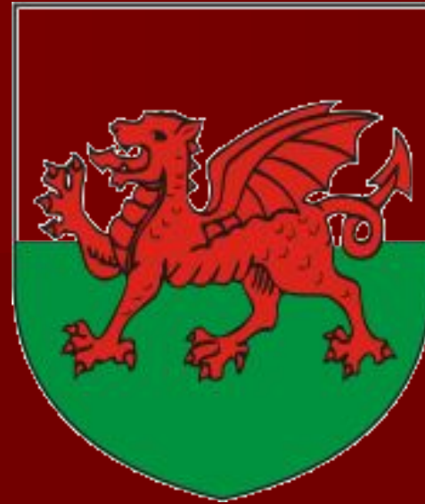
Wales, coat of arms