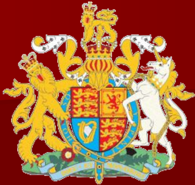
United Kingdom of Great Britain and Northern Ireland, coat of arms