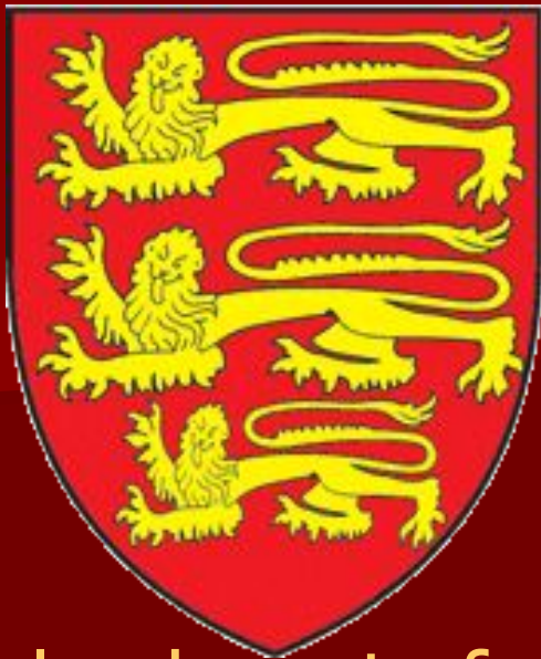
England, coat of arms