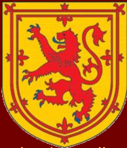
Scotland, small coat of arms