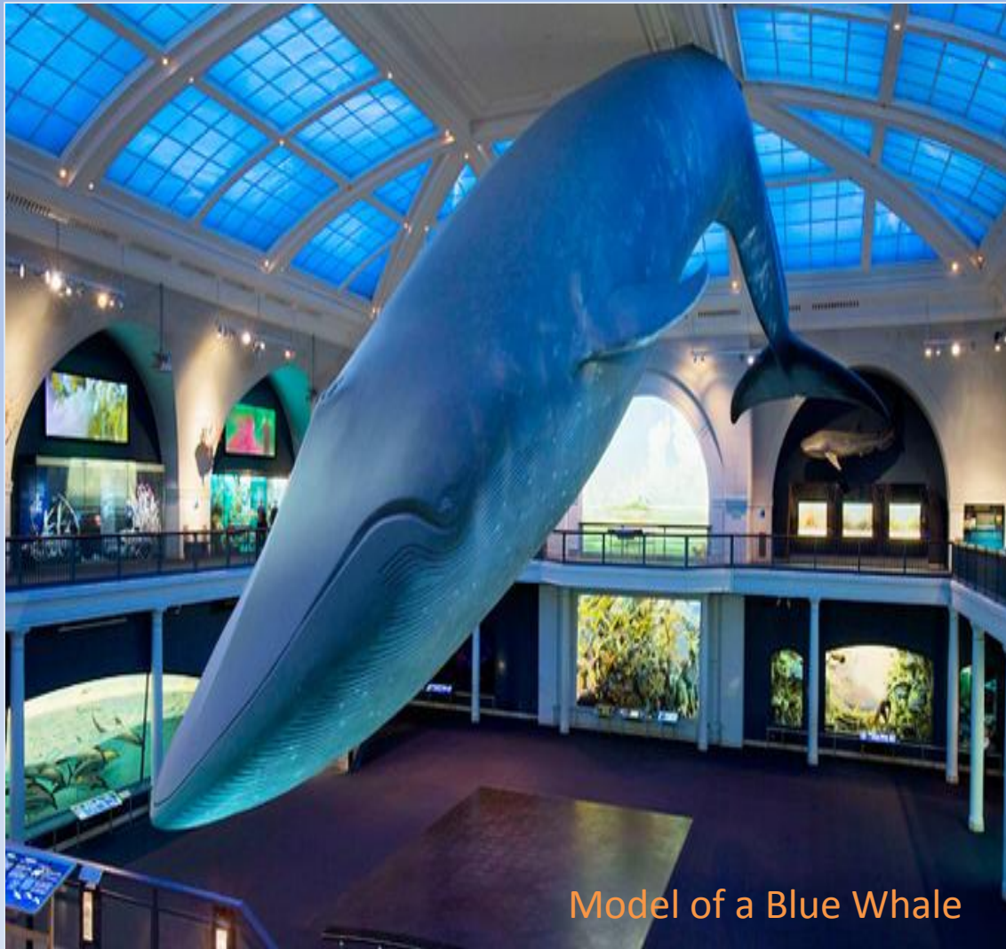
Model of a Blue Whale