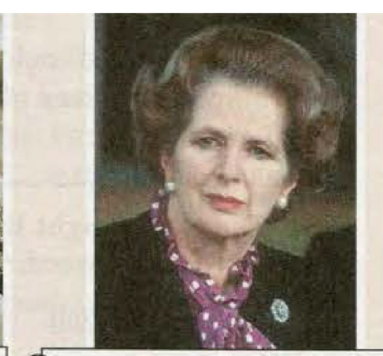
7 Baroness Margaret Thatcher