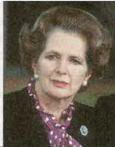
7 Baroness Margaret Thatcher