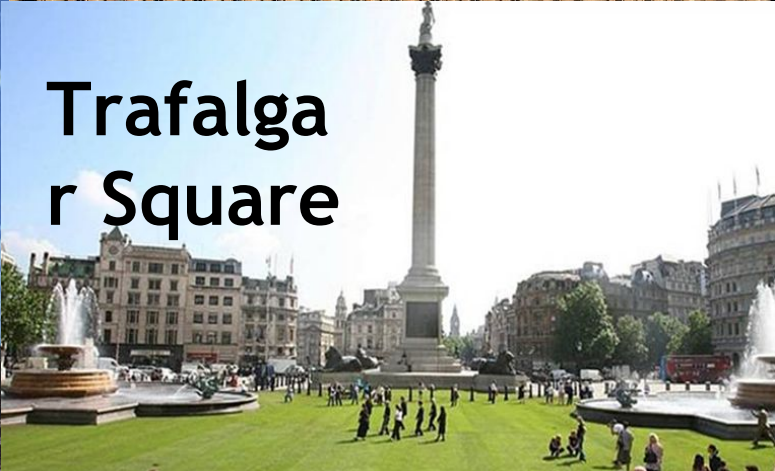
Trafalga r Square