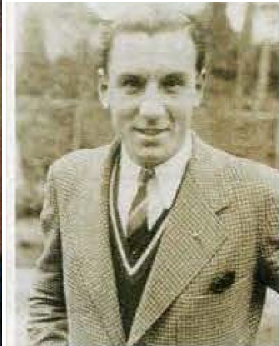
6 Fred Perry