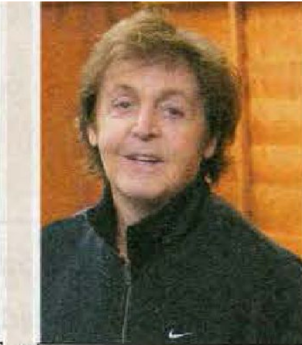
3 Sir Paul McCartney