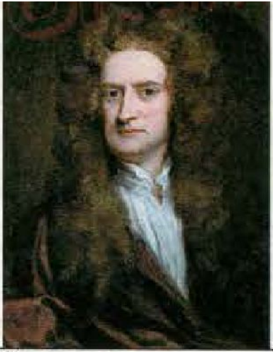
2 Sir Isaac Newton