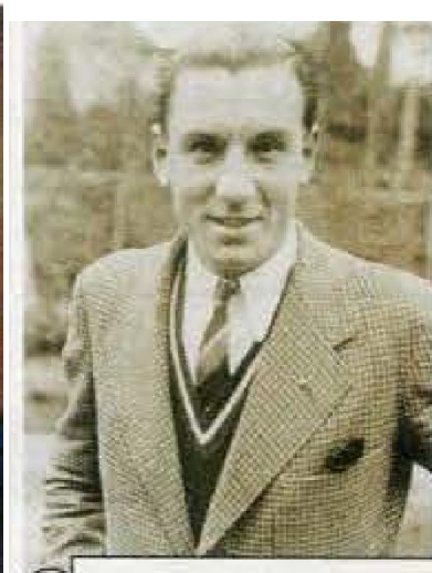
6 Fred Perry