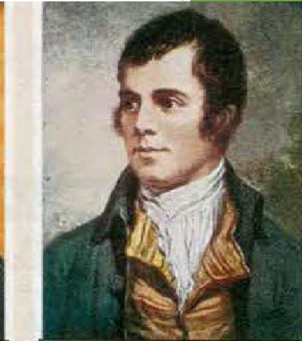
4 Robert Burns