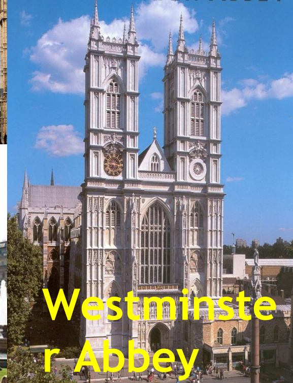
Westminste r Abbey