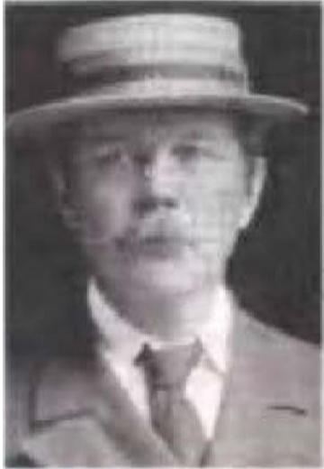
Sir Arthur Conan Doyle