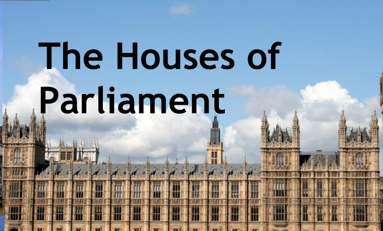
The Houses of Parliament