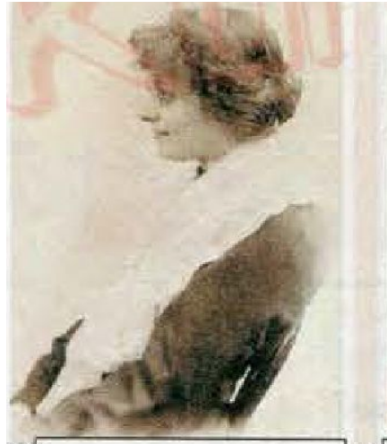
1 Eleanor Farjeon