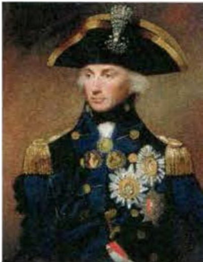
5 Lord Horatio Nelson