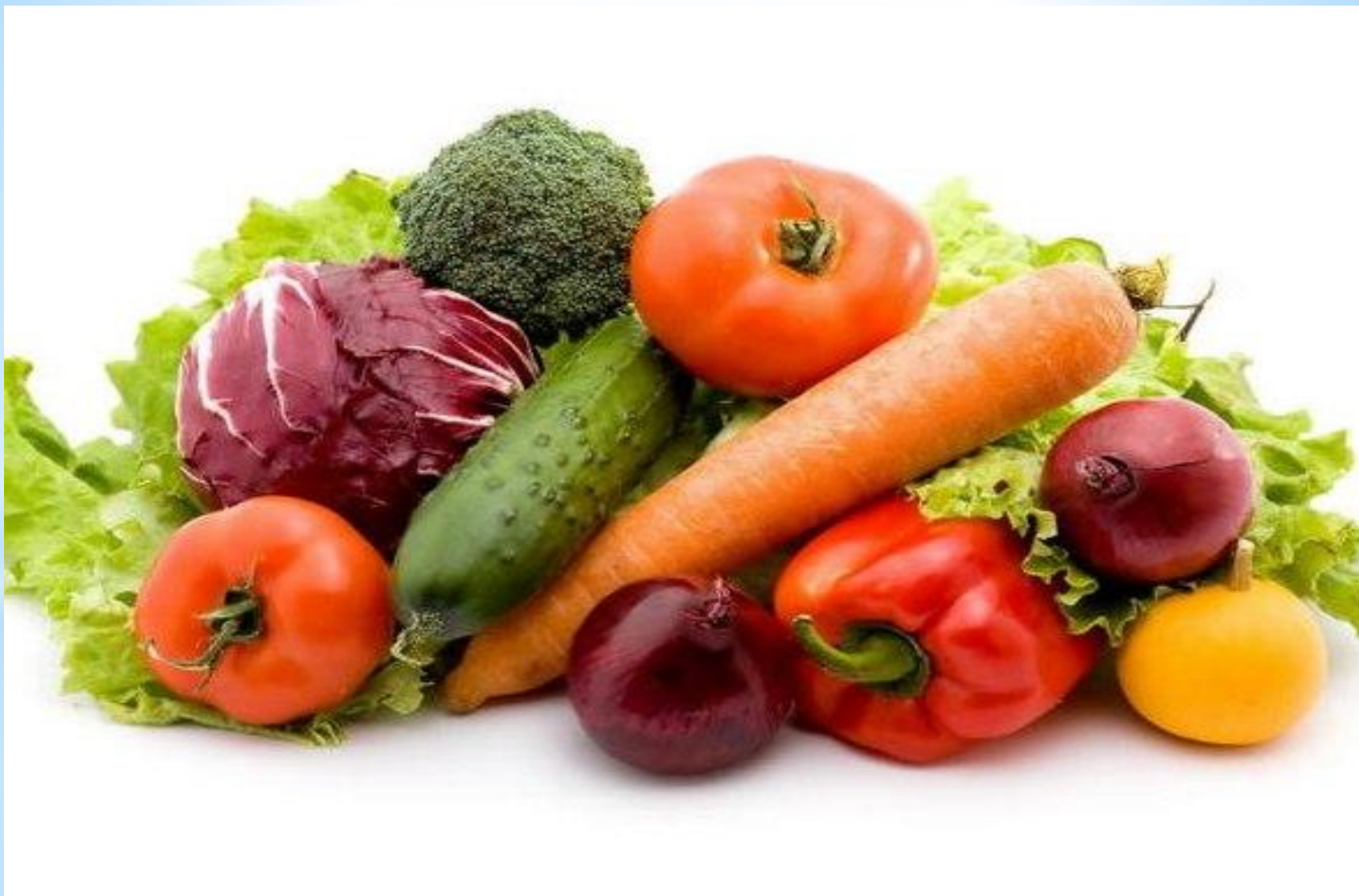
Vegetables - Көкөністер - Овоци