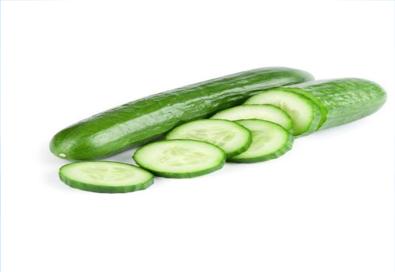
Cucumber- Қияр- Огурцы