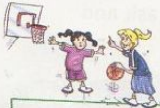
C playing basketball