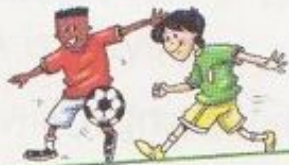
A playing soccer