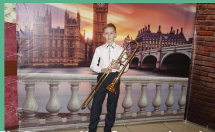
The pupil of musical school. The winner of different musical competitions