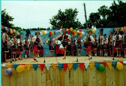
Our famous Ensemble “Rudariki”