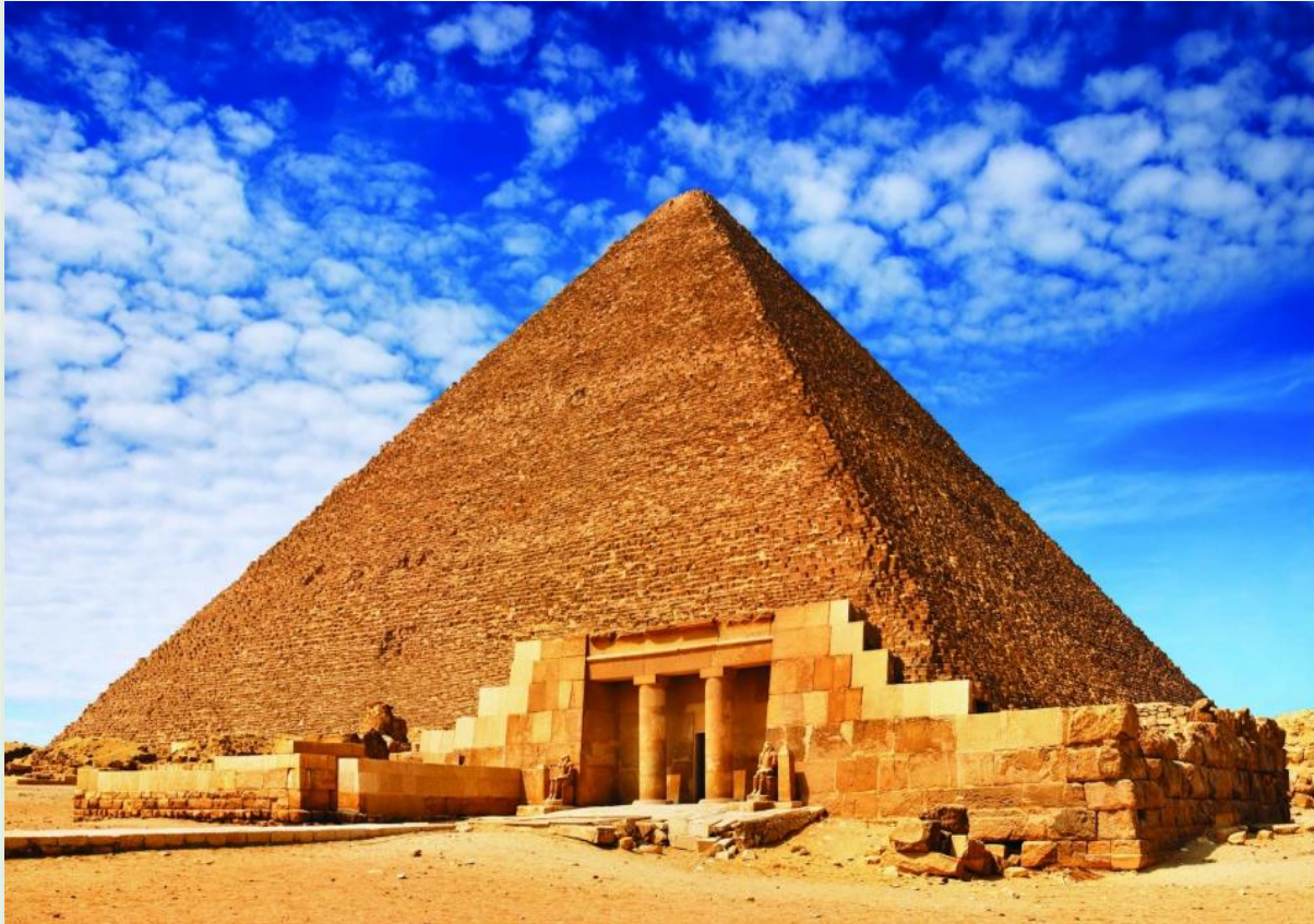
The Pyramid of Giza