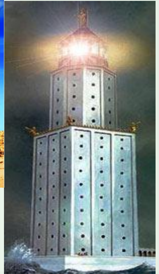
The Lighthouse of Alexandria