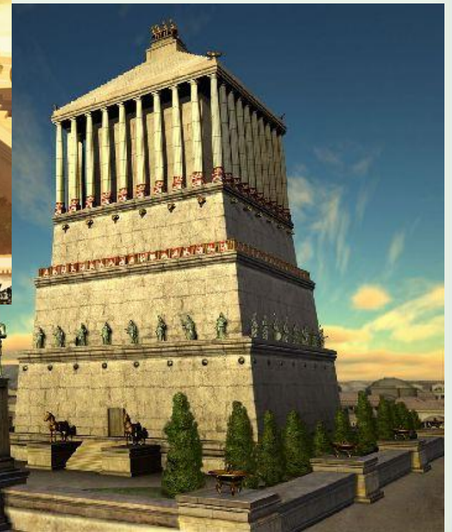
The Mausoleum of Halicarnassus