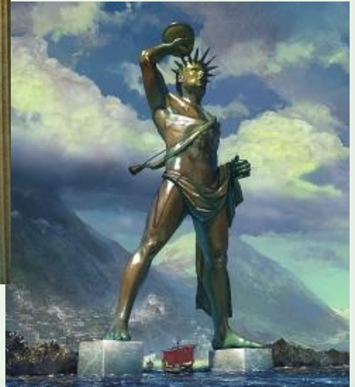
The Colossus of Rhodes