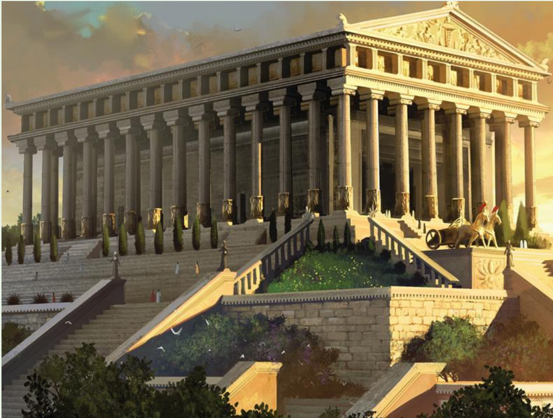
The Temple of Artemis