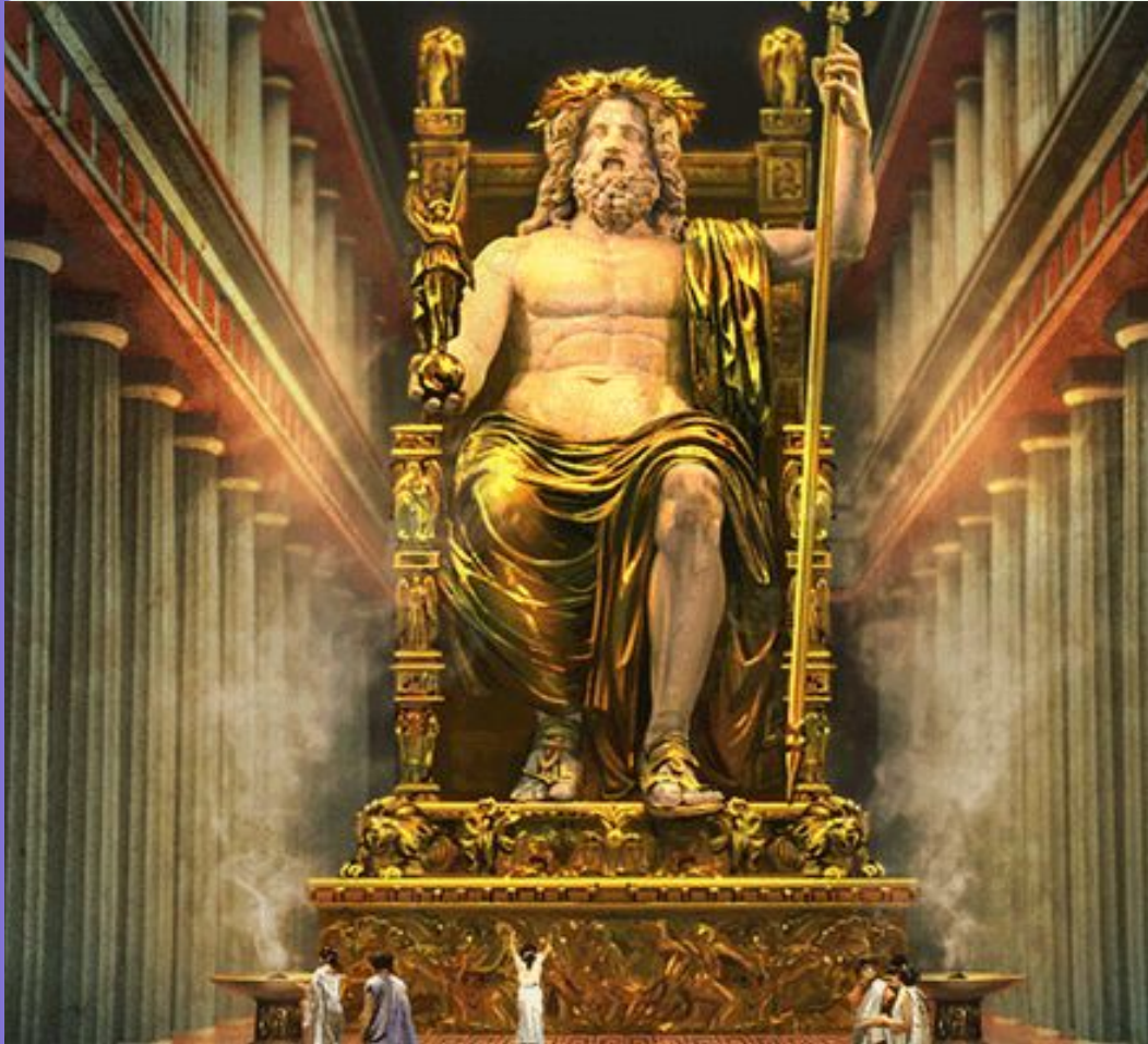
The Statue of Zeus