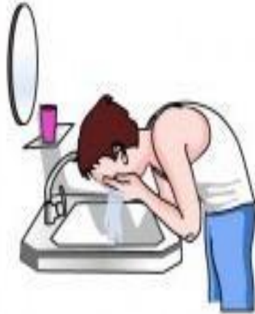
wash your face