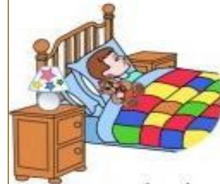
go to bed