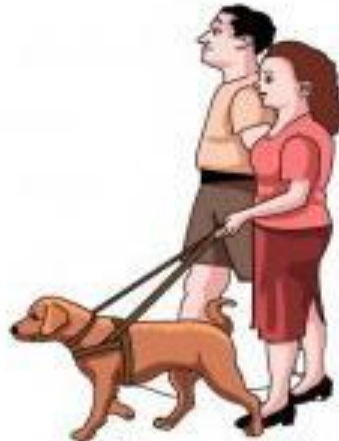
go for a walk