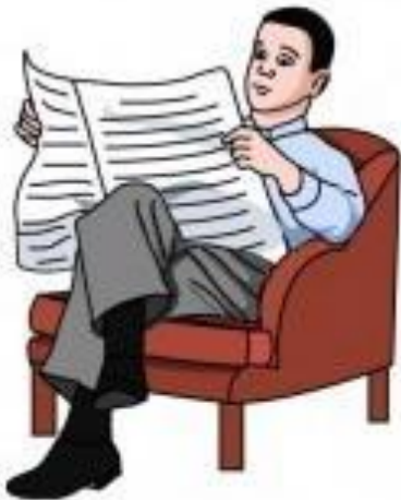
read the paper