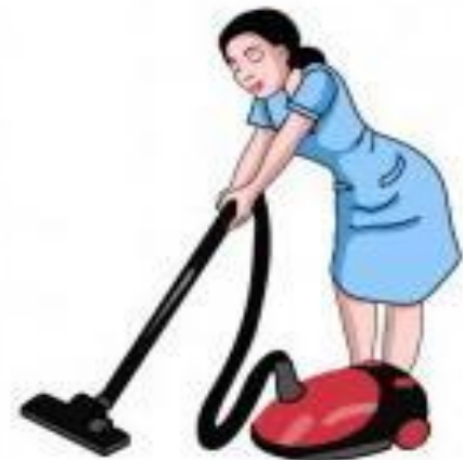
clean the house