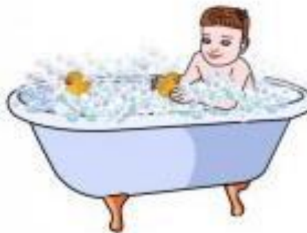
take a bath