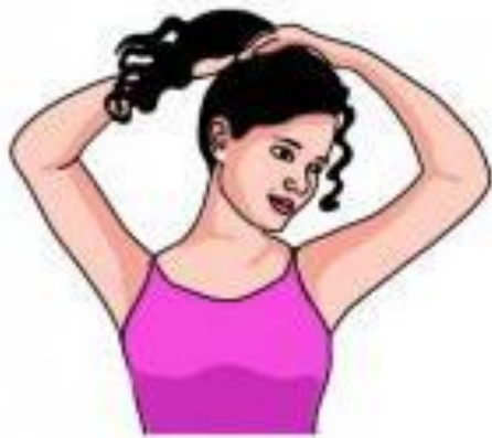
do your hair