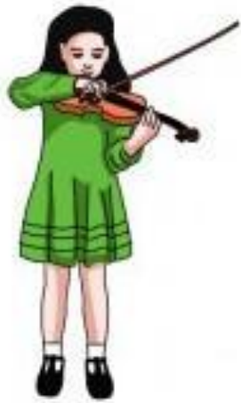
play an instrument