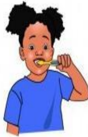
brush your teeth