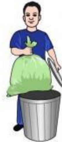
take out the trash