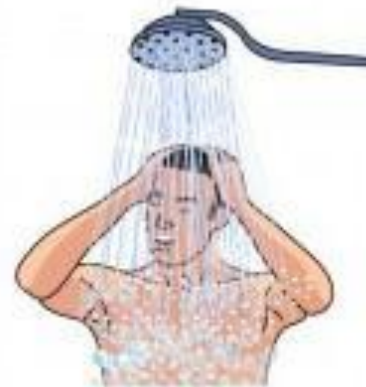
take a shower