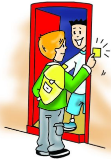
visit my friend