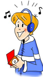
listen to music