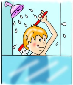
have a shower