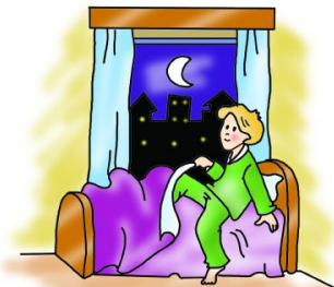
go to bed