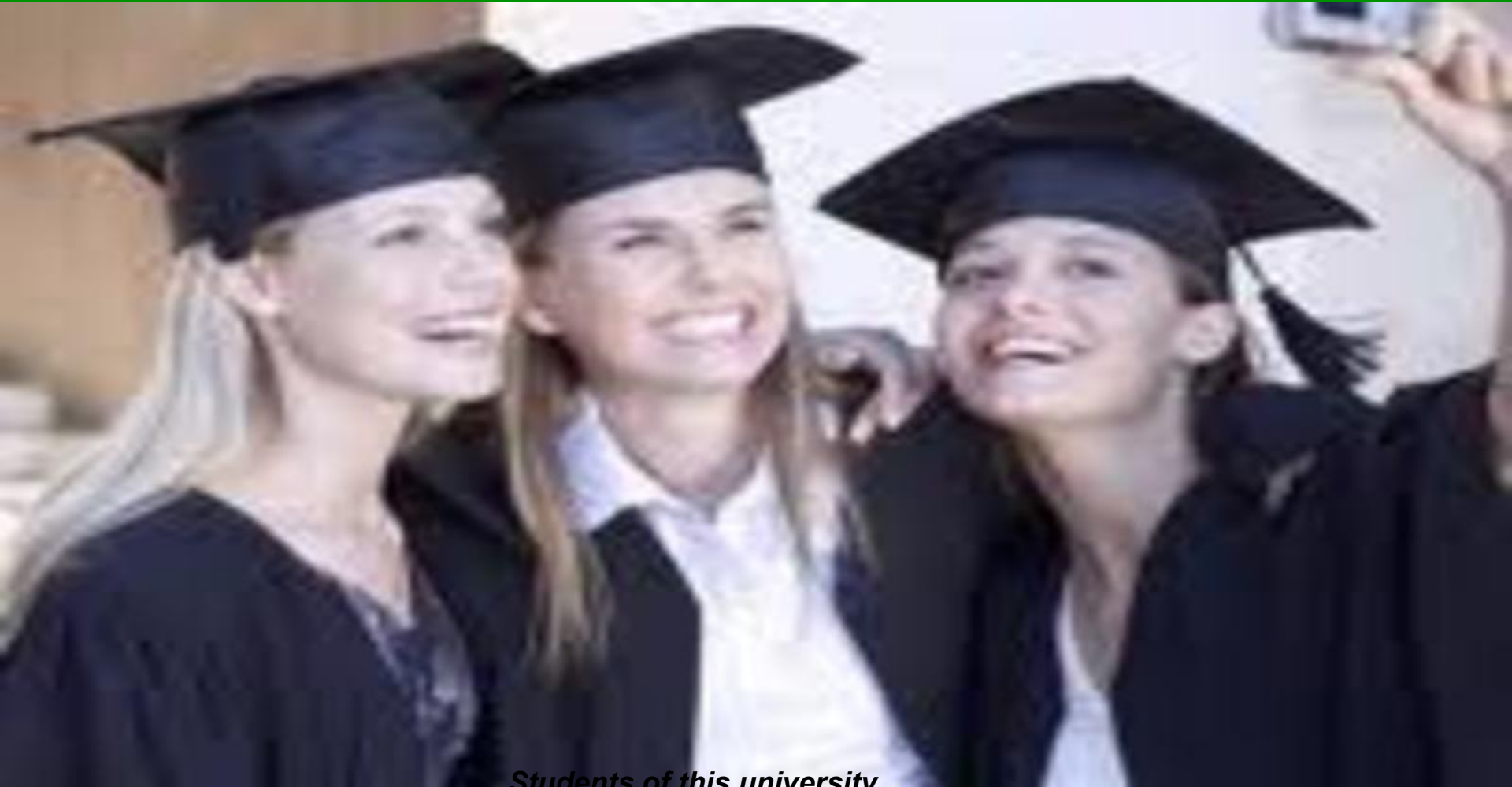
Students of this university

This university consists of four faculties: the faculty of theology, the faculty of medicine, the faculty of Arts, the faculty of science. The faculty of science includes social sciences and natural sciences. Studying of bachelor lasts four or five years.