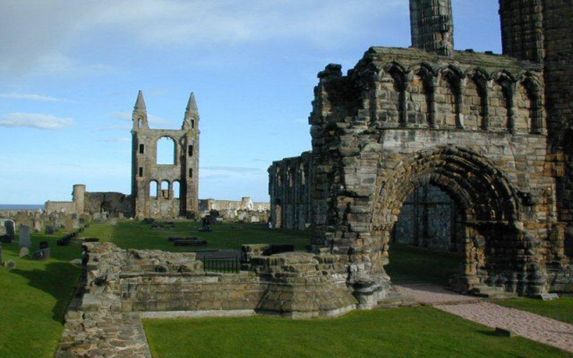
Ruins of college of Saint Leonard.