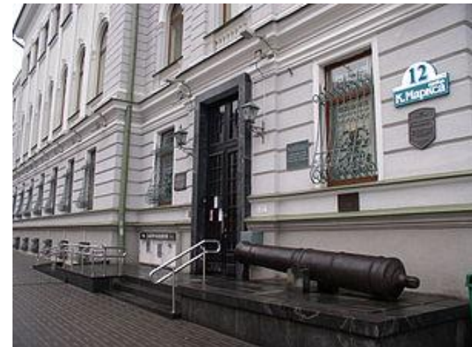
The National Museum of the History of Belarus