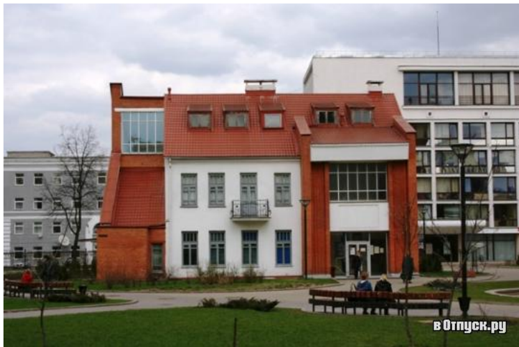
The Museum of the History of Belarusian Cinematography

Hello, today we will tell you about interesting and unusual museums in Belarus, such as The National Museum of the History of Belarus and The Museum of the History of Belarusian Cinematography.