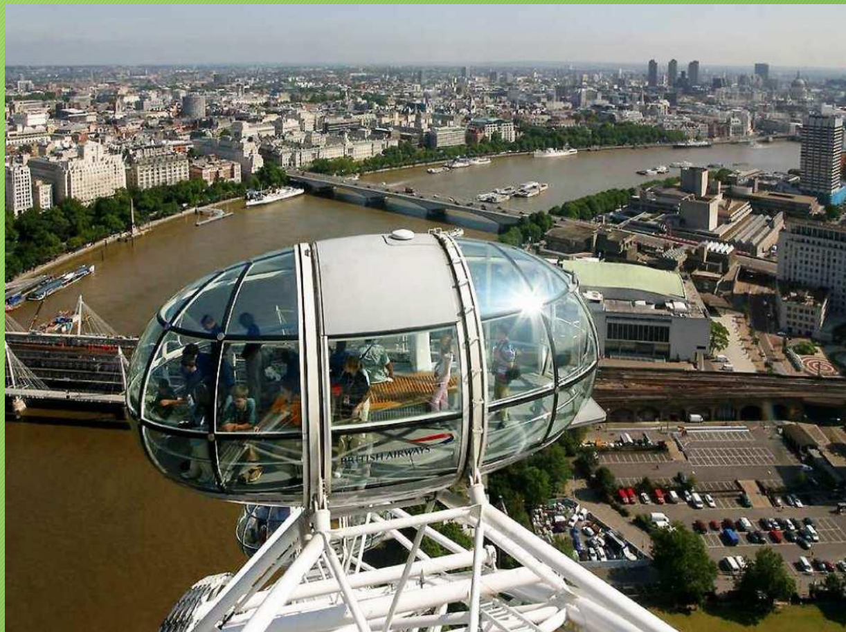
The London Eye (the Millennium Wheel)