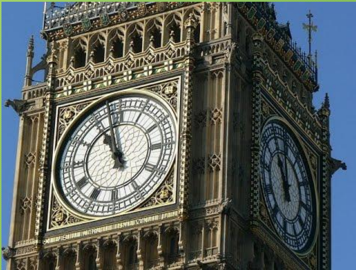
Big Ben (the Clock Tower)