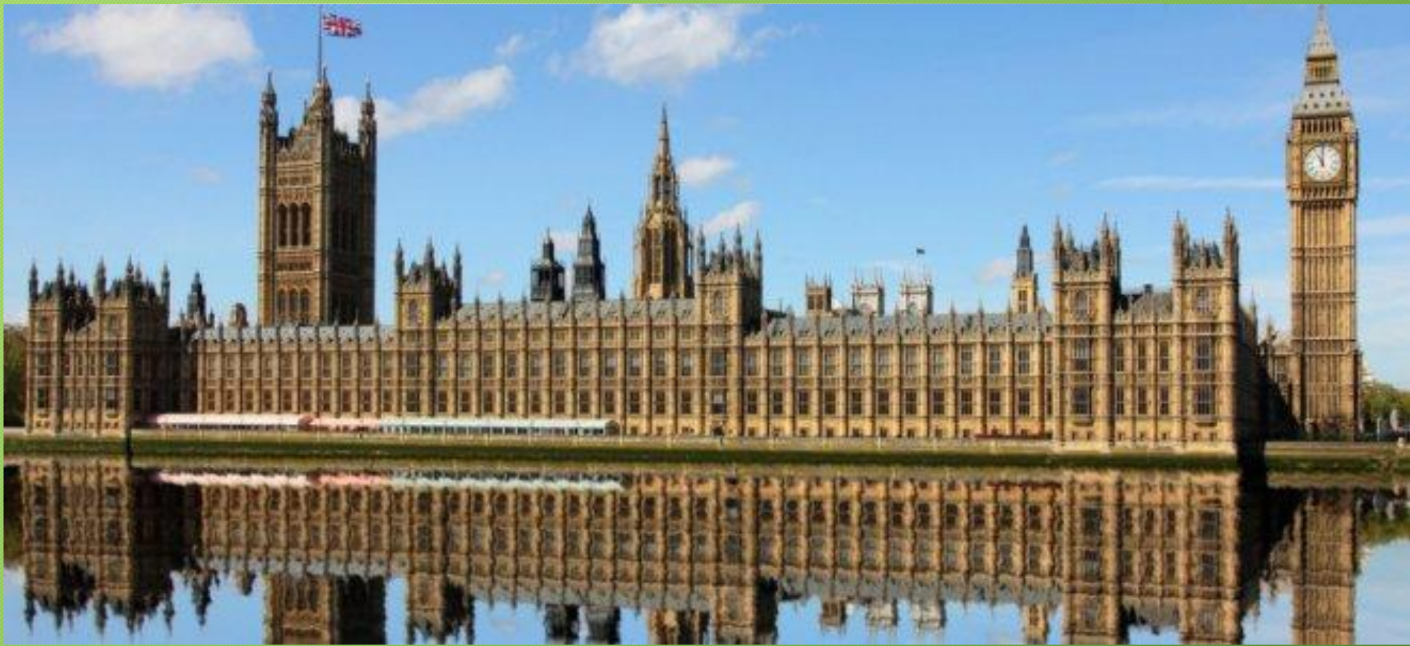
The Palace of Westminster (the Houses of Parliament)