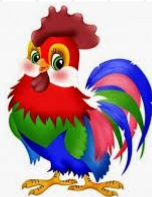
A little cock