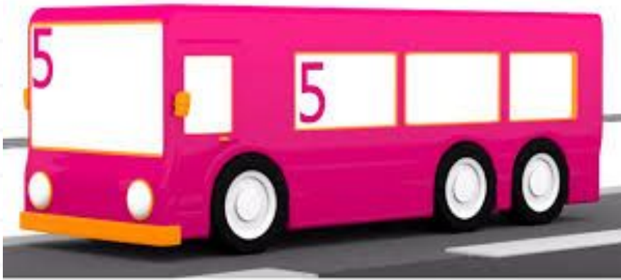
A red bus