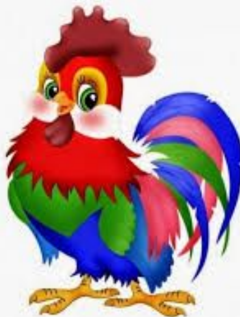
A big cock