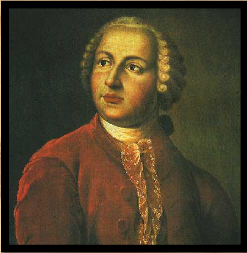
« On The Strata of the Earth », 1763

Lomonosov was the first person to record the freezing of mercury.