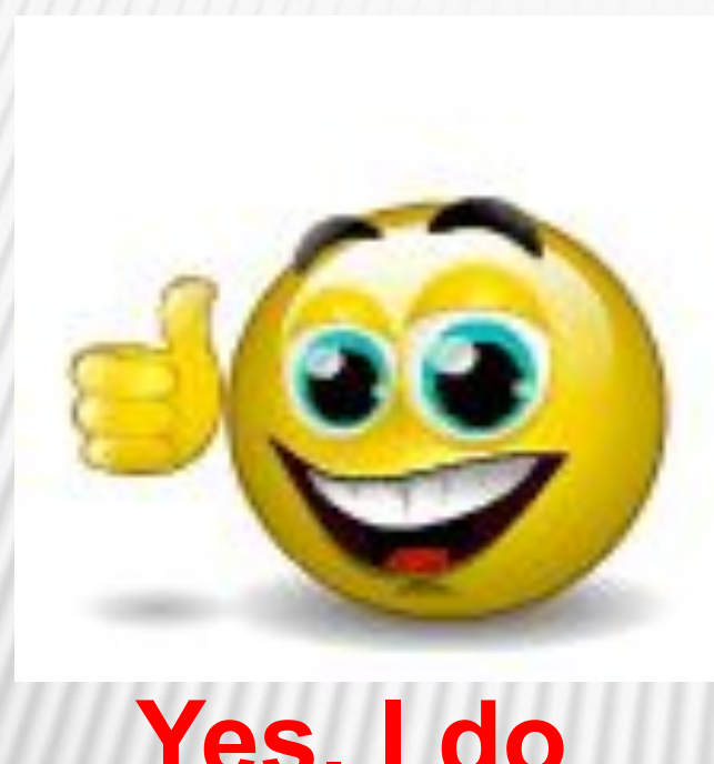
Yes, I do