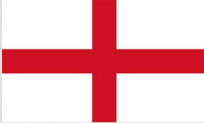
St. George's Cross