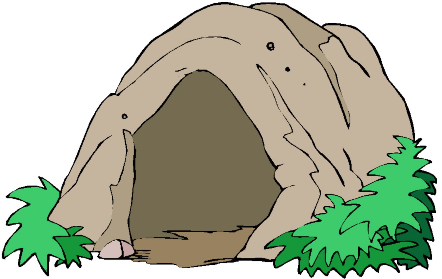
C a v e