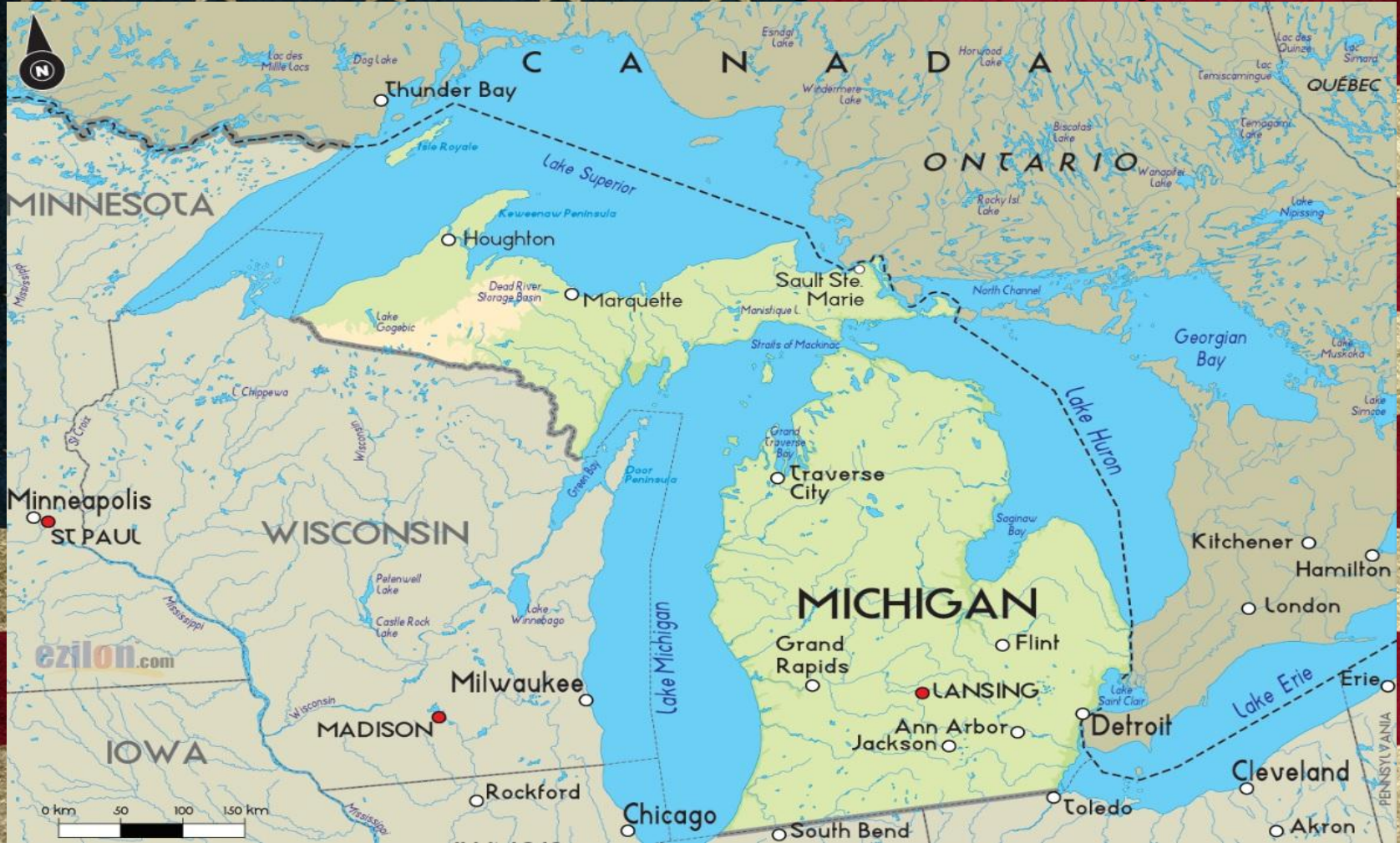
Michigan USA on the map

State is situated in the Midwestern of the US. Date of formation of Michigan - January 26, 1837