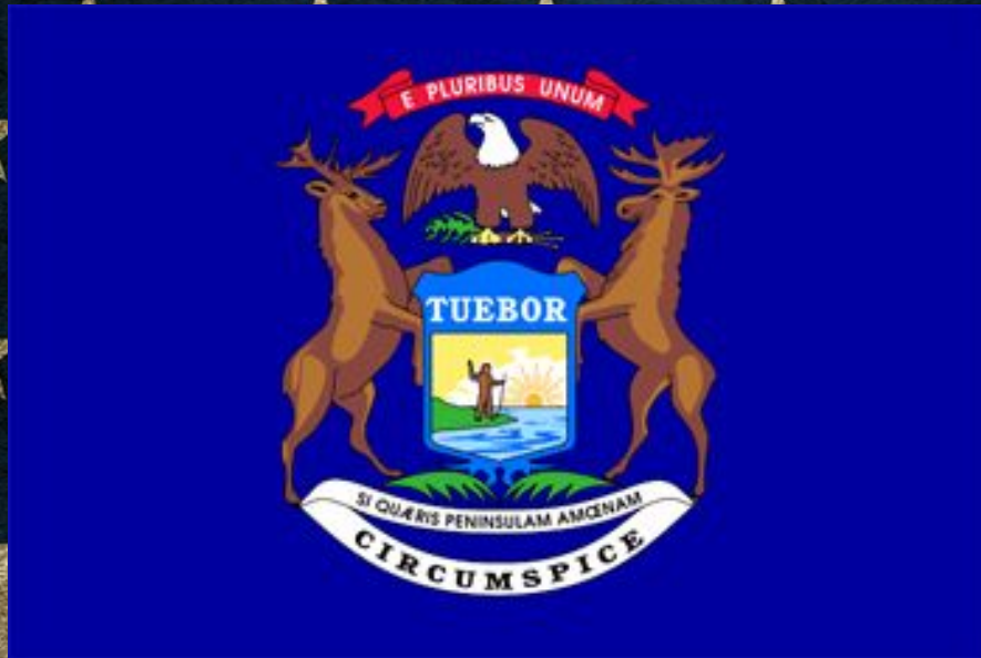
Flag of Michigan

The nickname of Michigan: "State of the Great Lakes," "Wolverine State"