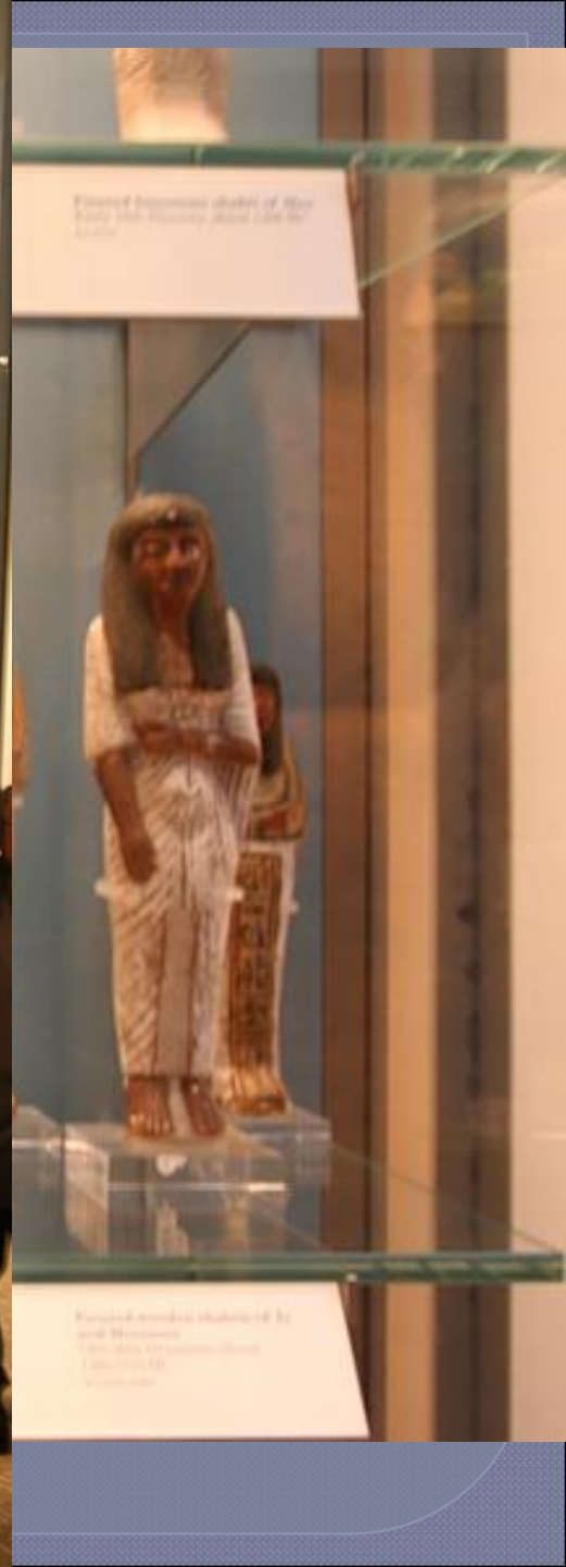
Fragmentary papyrus-bundle of the 18th Dynasty, showing the names of the pharaohs of the 18th Dynasty, including Amenhotep III, Amenhotep IV (Akhenaten), and Tutankhamun.