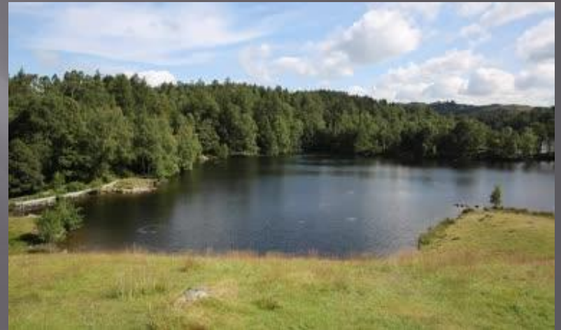
A SUNNY SPRING DAY