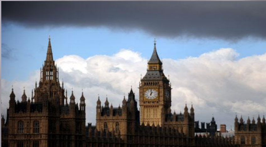
AN OVERCAST DAY

The United Kingdom has a temperate climate, with plentiful rainfall all year round. The temperature varies with the seasons seldom dropping below -11 C or rising above 35 C.