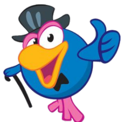
I am satisfied