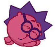
I am tired