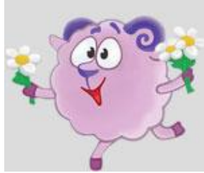
I am happy