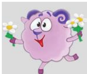
I am happy

Thank you for your work. - You were very active today. How do you feel?