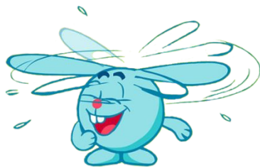
I am glad