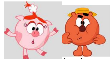
I am surprised