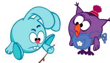
I am sad