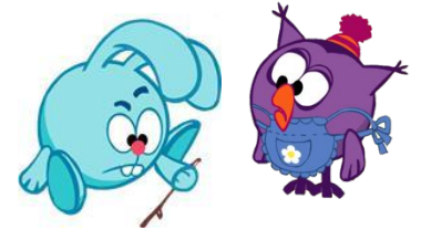
I am sad