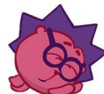
I am tired