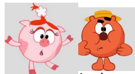
I am surprised